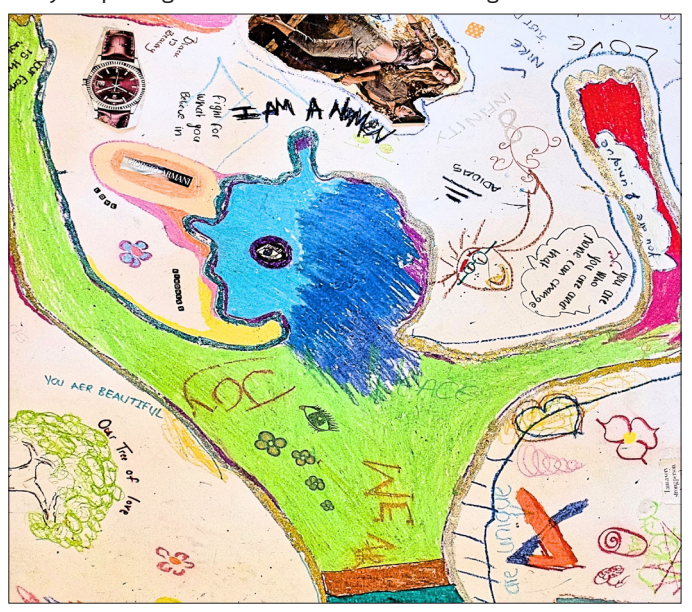
Figure 4: Body map image of connections made through movement

Artwork created by the group of young women