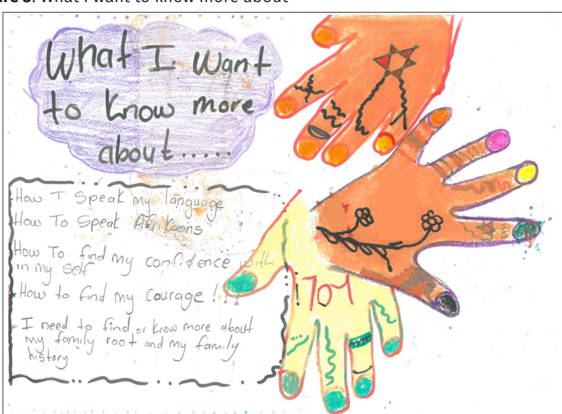
Figure 3: What I want to know more about