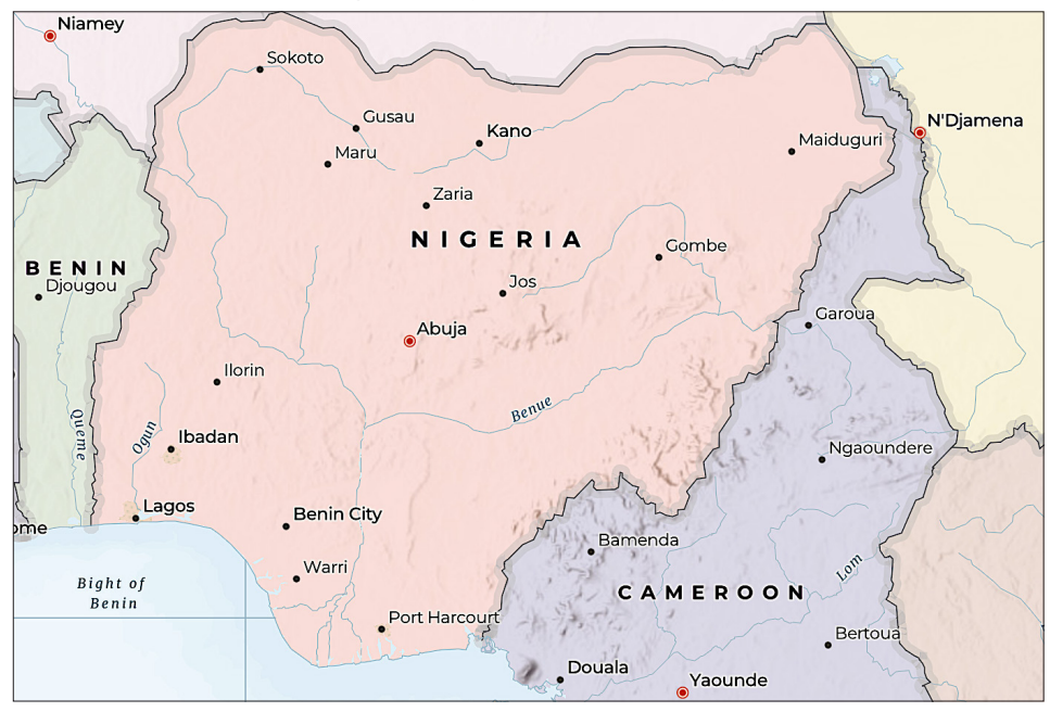
Figure 1: Map of Port Harcourt City