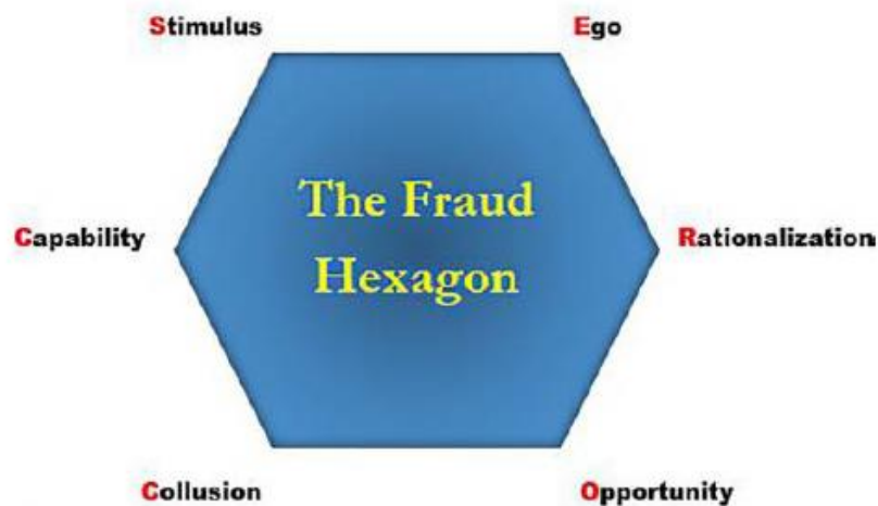
Figure 1 The Fraud Hexagon Model

rationalization, and opportunity (Cressey, 1953). However, over time, factors underlying fraud have turned into a fraud diamond, with four main points proposed by Wolfe and Hermanson (2004), where capability is an additional aspect. The fraud pentagon introduced by Crowe (2010) then added arrogance as the fifth condition triggering fraud. Lastly, Vousinas (2019) initiated an updated development of the fraud theory, i.e., the fraud hexagon (Figure 1), stating that the underlying fraud aspects consist of six, whereby collusion is promoted as the sixth aspect.