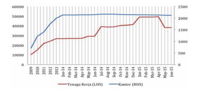
Figure 1 Labor and Network of Sharia Banking offices

In this case, Indonesia is very far behind with asset value of only US $ 35.62 billion. The asset value in the neighboring country is 10 times that of the sharia finance industry in Indonesia. Yet the Muslim community in Indonesia is bigger. When viewed from the labor and office network of Islamic banking from 2010-2015 is increasing. In the sense that people's access to transactions in sharia banking is easier. This can be seen in the picture below:<sup>9</sup>