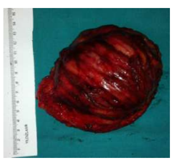
Figure 2 The total resected specimen with external oblique abdominis muscle

multinucleated giant cells [5]. MFH manifests a broadrange of histopathologic features; storiform-pleomorphic, myxoid, giant cell, inflammatory and angiomatoid type. The storiform pleomorphic pattern is the most common type [6] and it accounts for approximately two-third of