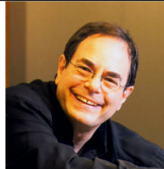
Keynote speaker Marc Prensky The Original "Digital Natives" Author