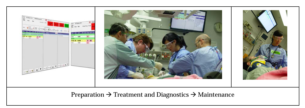
Figure 1: Setting of the Trauma Reception and Resuscitation system<sup>2</sup>

significant training required for the SMEs to enrich the system knowledge base, 3) the affordance of a self-sustaining knowledge base available for professionals to employ for review and training purposes, and 4) the medical staff have control over the reference data upon which the medical algorithms depend.