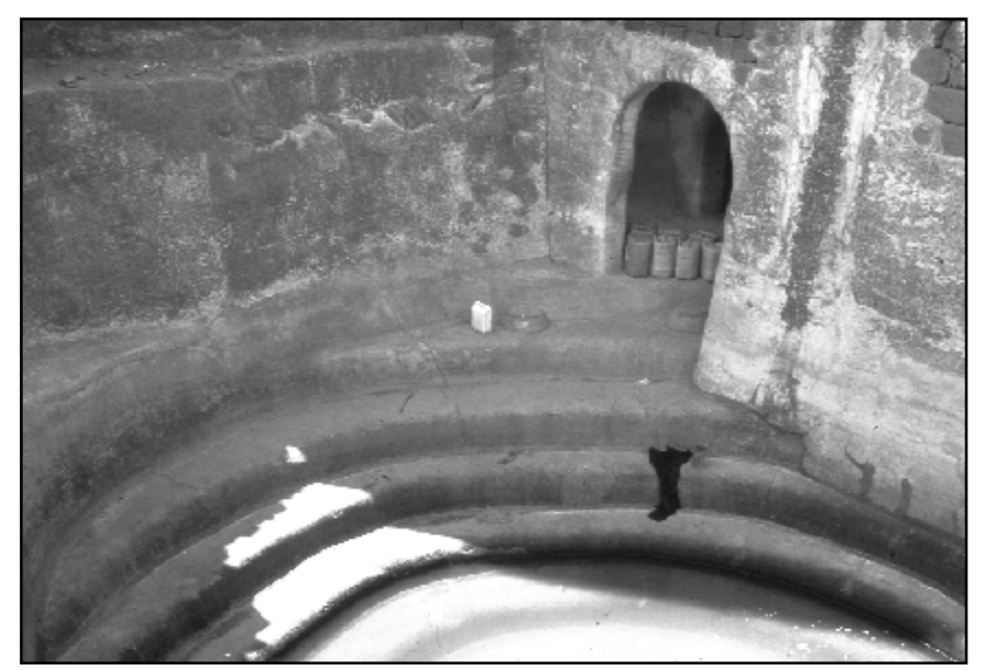
FIGURE 3: The Bayt al-Shaykh settlement's cistern.

On the plaster surface of the Bayt al-Shaykh cistern's perimeter wall, which is partly formed by the immediately adjacent houses, is an inscription together with a group of seven signs (Figure 4, below). Ahmad ibn `Ali al-Buni (d. 1225), a prolific writer on magic, described these signs. The main work attributed to him is Kitab Shams al-Ma`arif wa-Lata`if al-`Awarif . It is assumed, however, that major parts of the book were only written at the beginning of the fourteenth century by a group of authors, for which stylistic reasons can be cited, as well as the fact that the text mentions individuals who lived after al-Buni's death.<sup>5</sup> For the purposes of this article, the question of authorship and exact date are not significant. The work and al-Buni, both of