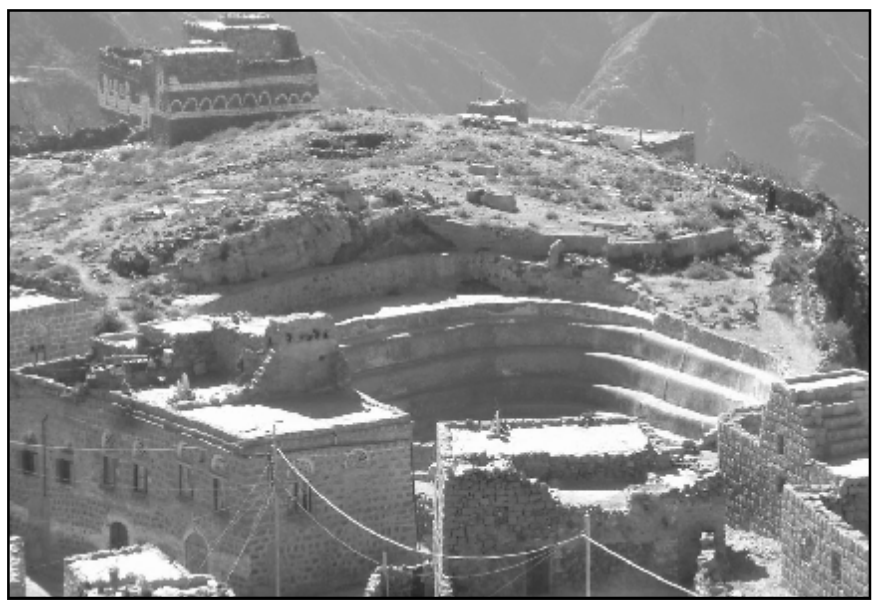
Figure 2: Public cistern on the escarpment of al-Jabin.

north side and one on its south side (Figure 2). The southern one, situated below the military fort, developed a crack years ago and, despite an attempt to mend it, remains largely empty; the northern one is fully functional.