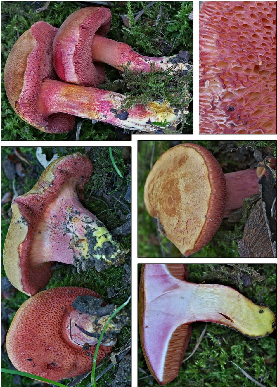
Fig. 3. Fruit-bodies of Chalciporus rubinus recorded in Wrocław.