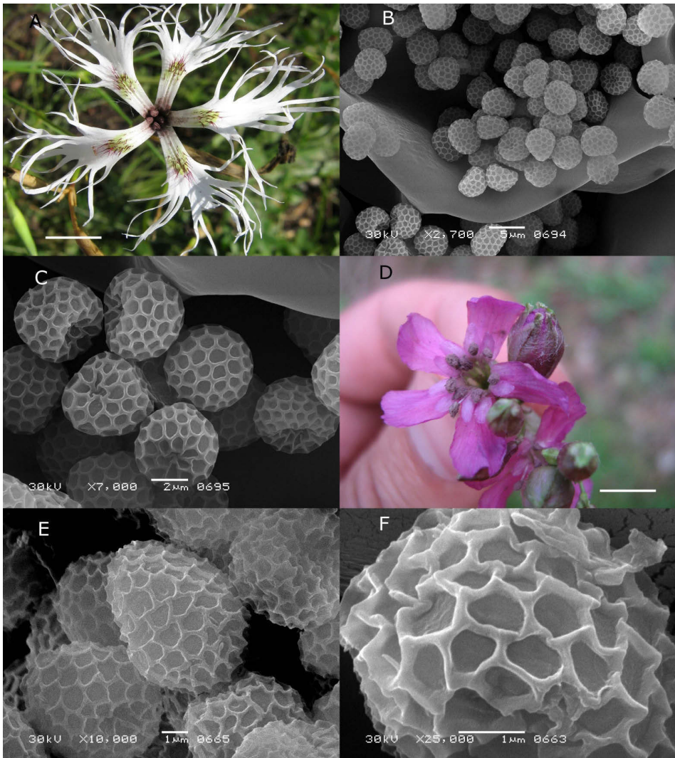
Fig. 2. Microbotryum superbum on Dianthus stenocalyx : A – infected flower, B, C – spores. Microbotryum lagerhemii Denchev on Lychnis viscaria : D – infected flowers, E, F – spores; B, C, E, F – in SEM. Scale bars for A, D = 5 mm; B = 5 \mu m; C = 2 \mu m; E, F = 1 \mu m.