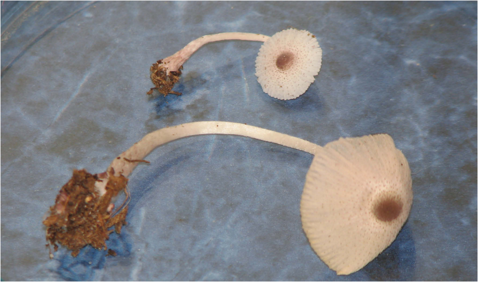
Fig. 1. Specimens of Leucocoprinus lilacinogranulosus from Poland.