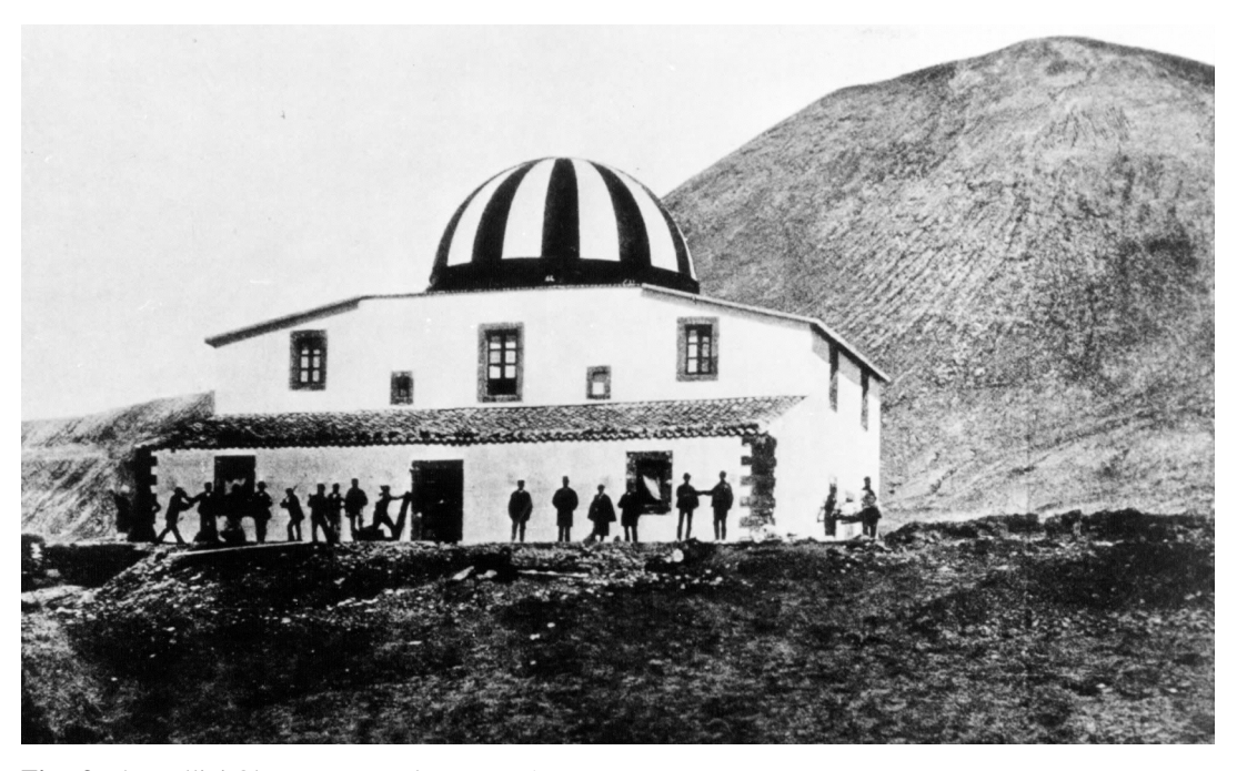
Fig. 3. The Bellini Observatory on the Mount Aetna.

ta (Chinnici, 1995-1996), which had to serve as a winter station for the solar observations programme of the Società degli Spettroscopisti Italiani: the Observatory was installed at the St. Xavier's College and directed by Eugène Lafont S.J. (1837-1908) but, unfortunately, the Observatory could not contribute to the Society's scientific programme. The following year, Tacchini planned the establishment of an astrophysical Observatory on the slopes of the Mount Etna: a high site in fact could give the best chances to make solar spectroscopic observations as well as to try to observe the solar corona, normally visible only when the Sun is eclipsed. Many letters from and to local authorities show the genesis of the project and its development which led to the establishment of the Catania Observatory in 1885. Through Tacchini's correspondence at UCEA it is also possible to track the path of the establishment of the Mount Cimone Observatory, which Tacchini planned in 1880 as an astronomical and meteorological Observatory, as well as that of a mag-