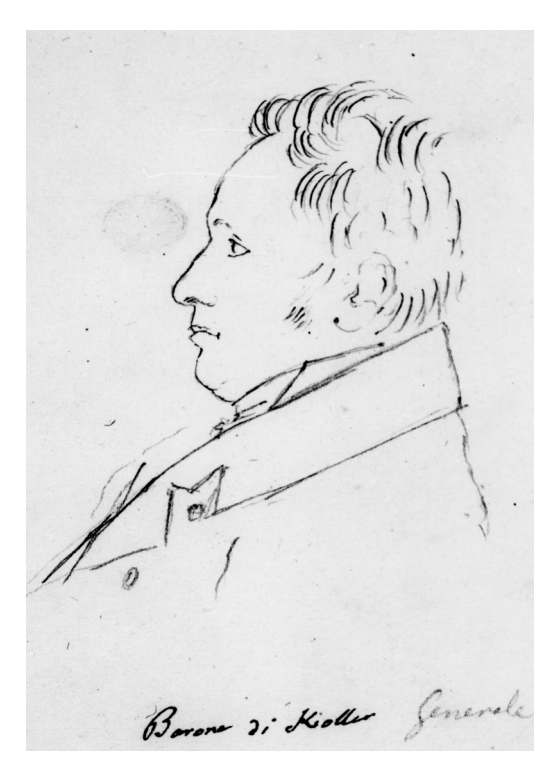
Fig. 3. Portrait of Franz Friedrich von Koller, Austrian ambassador in Naples, taken by Giovambattista Amici with his «camera lucida» in 1817 during his stay in Naples (Biblioteca Estense di Modena, Fondo Amici, donazione eredi).

For the modern design and execution and for the optical instruments used Visconti's projects have survived over time, unfortunately, for