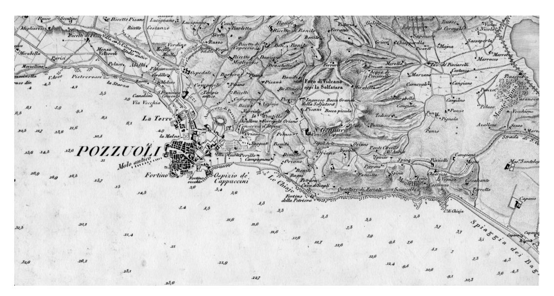
Fig. 7. Detail of the sheet n. 8 of the «Carta dei dintorni di Napoli», scale 1:25000, realized by the Geographer Engeeneers Corp of Naples in the years 1817 and 1819. On this map Visconti planned the levelling operation for studying the Flegraen bradyseism (Private collection).

official topographical surveys carried out for the Great Map of the Kingdom of Naples, as shown in another letter by Visconti to Monticelli in May 1829: