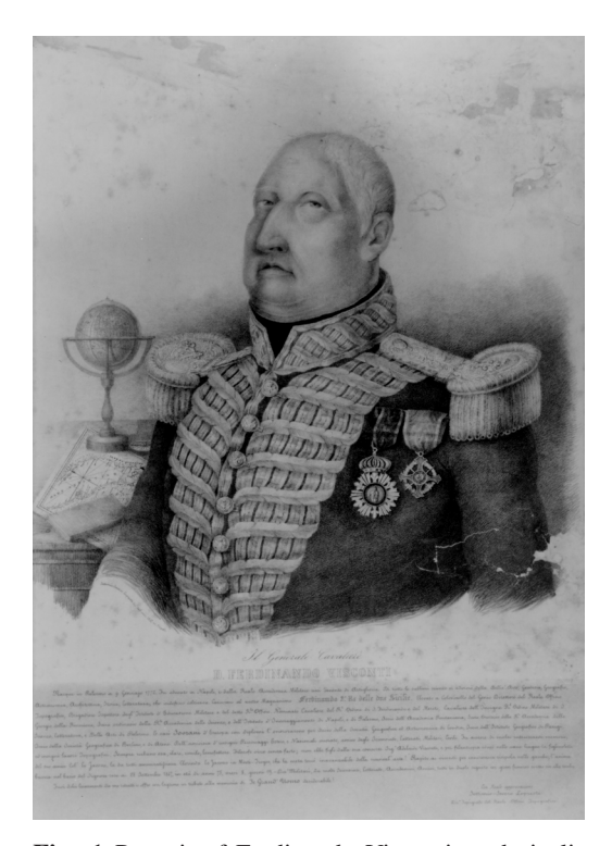
Fig. 1. Portrait of Ferdinando Visconti made in lithography by Settimio Severo Lopresti in 1847 (Private collection).

ternational level of knowledge in those fields imported into the Kingdom of Naples.