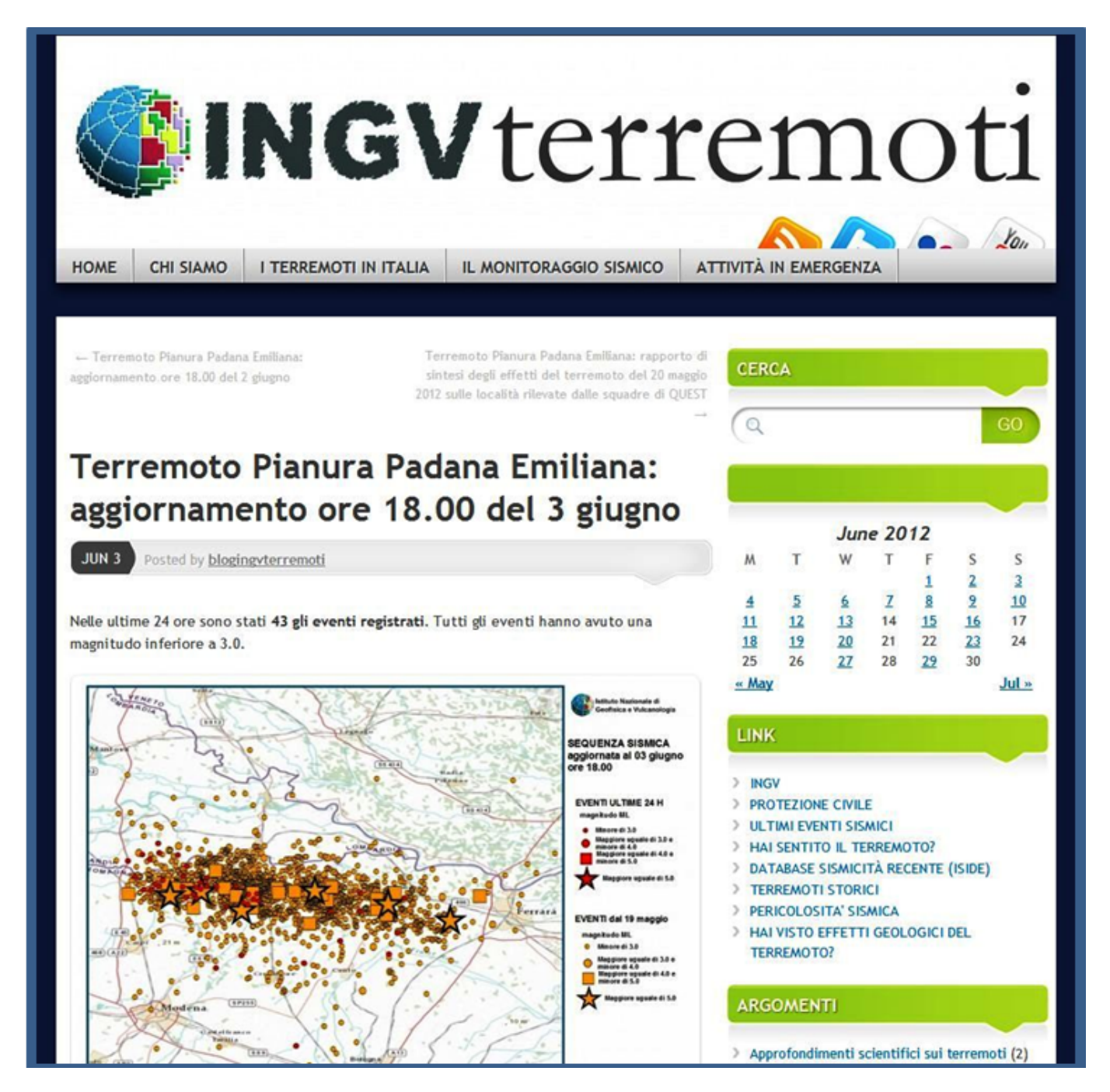
Figure 1. The top part of the INGV terremoti blog as it appeared on June 3, 2012, soon after the most clicked update was posted (857,785 clicks).

such questions and comments, which was not yet feasible for our present organization. It is our wish to open this section in the future.