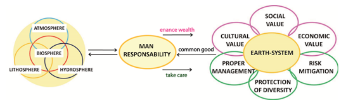
Figure 4: Sketch of the dynamic relations inside the Earth system and their interconnection and relationship with human's responsibility.

The contribution of Stoppani is therefore of great significance in establishing the criteria that should guide, also nowadays, researchers,