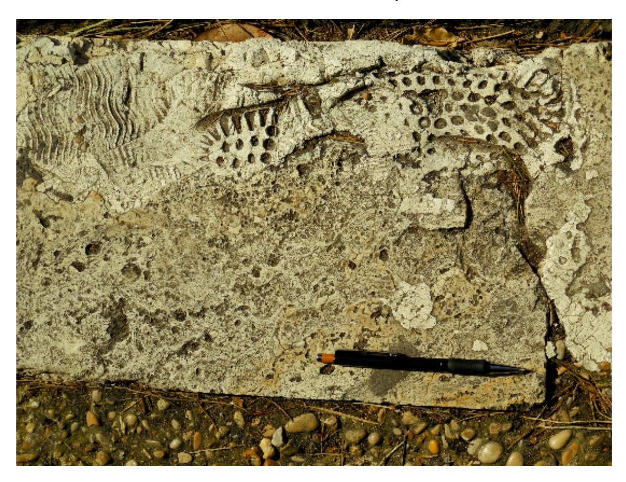
Figure 2: Urban fossil on a sidewalk of the city of Rome (Italy): the travertine sedimentary structures are juxtaposed to the human footprints in cement.

In particular, he realized that human beings, with the use of reason, are able to change nature and to actively shape the Earth surface, and thus define humans as a real "geological agent." Having understood the importance of human impact on nature, he felt the need to introduce in the Corso di geologia (Course of geology" (1871-1873) the concept "Anthropozoic Era" for defining the latest geological period in which human action began to be significant and decisive in the evolution dynamic of the Earth. This intuition, that somehow anticipates the modern concept of Anthropocene (Crutzen, 2002; Steffen et al., 2004), can be considered a preamble of the thought which would deepen later, in nineteenth century, with the birth of geoethics (Peppoloni and Di Capua, 2012; Bobrowsky et al., 2017).