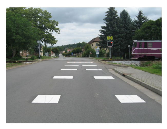
FIGURE 3. Level Crossing Highlighted by 'light bar' and Optical Psychological Brake.

knows, that it usually takes a long time before the train approaches level crossing after the warning light came on. This situation is particularly dangerous for the next people in a row, because human psychology works like 'He made it, so will I'. These people enter the level crossing following the example they have seen and tragedy is near.