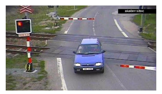
FIGURE 4. S-manoeuvre [6].

Second cause of dangerous situation is when driver is closed between the safety barriers. But this mistake does not have to be fatal. First option is that second passenger can raise the barrier or the barrier can be lifted up by the bonnet of a car. Barriers are intentionally balanced, that only a minimal strength is required to raise them. Second option is breaking the barrier with a car. Every barrier is designed to be easily broken by impacting on it in horizontal direction. It is necessary to raise public awareness about