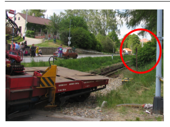
FIGURE 1. Vegetation Intruding Visibility Splays on Level Crossing (source Police Czech Republic).

Visibility splays are defined in design standard CSN 73 6380, which is legally binding on the basis of regulation No. 177/1995 Sb. This standard explains how to correctly determine visibility splays, however it has one issue. According to the Paragraph No. 88 of this regulation, above mentioned standard CSN 73 6380 is not binding for level crossings, which project documentation was approved before this standard came into effect. Vast majority of railway was designed and built in the end of the 19th century and in the first half of the 20th century. Visibility splays on these older railways are defined by internal regulation of a railway operator SZDC S 4/3. Calculations are in the principle similar to methods used in design standards and are based on physical principles, however in the end of the regulation S 4/3 it is allowed to reduce visibility splays by half. This statement is based on the theory of probability and enables to reduce visibility splays in the case of a low probability of a collision, which implies on level crossings with low operational speed on the line along with low traffic volumes. However with this statement cannot be agreed either from the scientific view or from the human view. It is essential to respect physical laws and give driver enough time to decision, reaction and for safe crossing of a level crossing [3, 4]