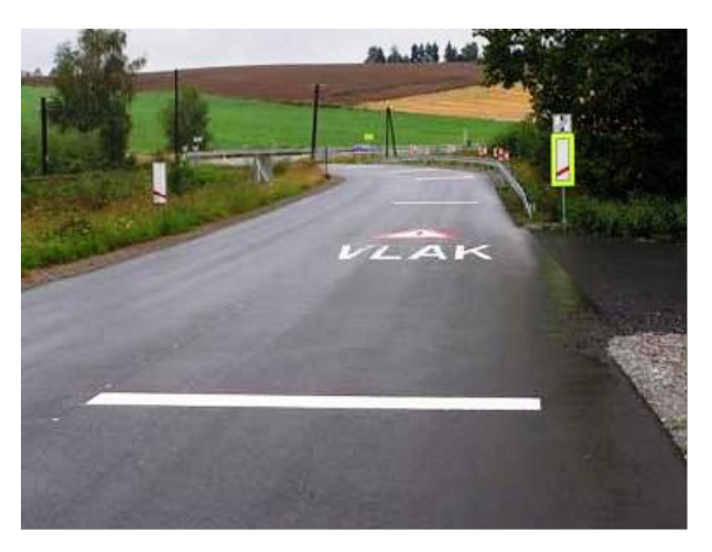
FIGURE 2. Level Crossing Highlighted by Optical Psychological Brake V18.

"Additionally it is used on intersection to mark out where vehicle has to stop to give way, in front of the controlled pedestrian crossing and alternatively also in front of the level crossing" [5].