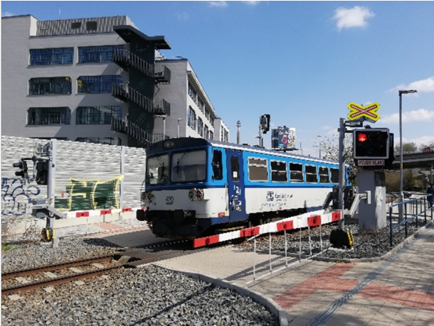
FIGURE 2. Railway crossing for pedestrian, Prague 5 – Jinonice.

the years 2014 to 2018. A total of 853 extraordinary events were recorded during the period under review. 422 accidents of the total number, i. e. 49.4%, of extraordinary events were with another participant in road traffic on RC – Table 1. The remaining, i. e. 431, extraordinary events were accidents of a regional train with game, different train, fallen tree or pedestrian in a section of track outside the RC [1].