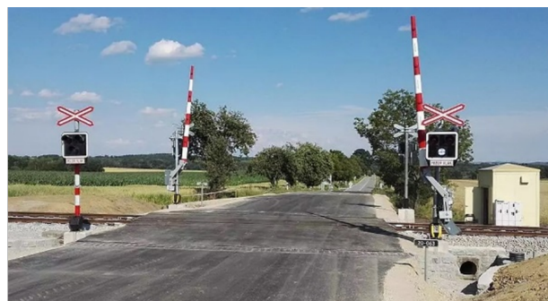
FIGURE 5. RC secured by a light device with mechanical barriers.

RC with MB are the best secured RC in the Czech Republic – Figure 5. There are a total of 1 475 RC with MB in the Czech Republic. In contrast to others types of RC are RC with MB also equipped with mechanical barriers, which prevent road vehicles from passing RC when the train passes. Drivers of road vehicles are first alerted to the arrival of rail vehicles by light and sound signals and then by lowering the barriers over the road [1].