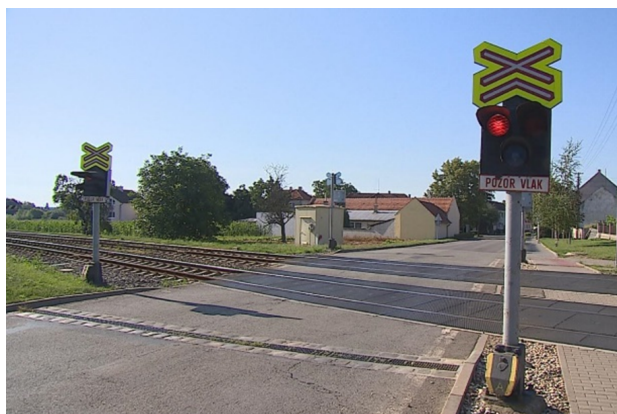
FIGURE 4. RC secured by a light device without mechanical barriers.

The RC with LD belongs to the so-called "secure crossings" – Figure 4. There are a total of 2 388 RC with LD in the Czech Republic. RC with LD is equipped with light and sound signals, which alert the drivers of road vehicles to the arrival of a railway vehicle. The arrival of the railway vehicle is signalled by an intermittent red light supplemented by the sound of a bell. The RC with LD can be supplemented by a white signal indicating safe crossing of the RC [1].