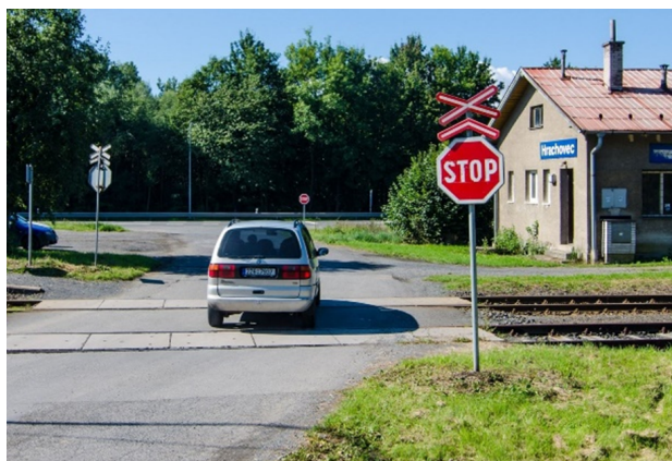
FIGURE 3. RC secured by warning crosses.