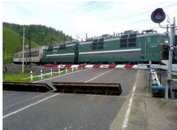
FIGURE 6. Railway crossings in Russia Federation [4].

For these reasons, it is appropriate to reduce the risk of accidents in the RC through less invasive RC modifications. The interconnection of communication between rail and road vehicles appears to be a possible solution that could lead to a reduction in accidents on the RC. For first step, it would be appropriate to start intensive cooperation between the manufacturers of the European hybrid train protection system ETCS