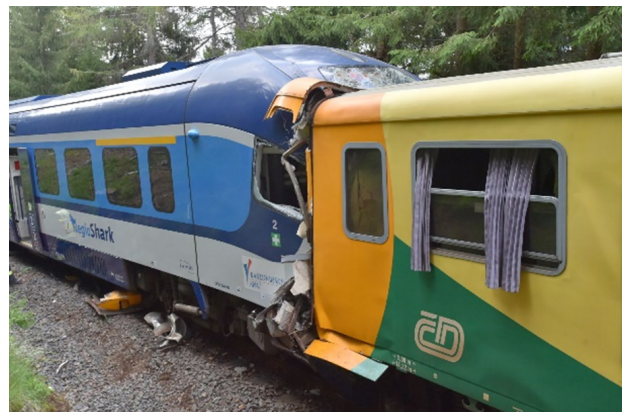
FIGURE 7. Train accident near Pernink.

After the accident of two trains on July 7, 2020 near Pernink in the Karlovy Vary region – Figure 7, the debate on the low security of railway traffic in the Czech Republic and the need to increase traffic safety has revived [5].