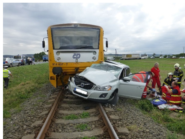
FIGURE 1. Train accident with a road motor vehicle.

From a societal point of view, there are growing demands to increase road safety and reduce the risk of accidents. Vehicle safety is divided into two basic groups: active and passive safety. Components and systems of active safety are designed to reduce the risk of an accident, while components and systems of passive safety are designed to minimize the conse-