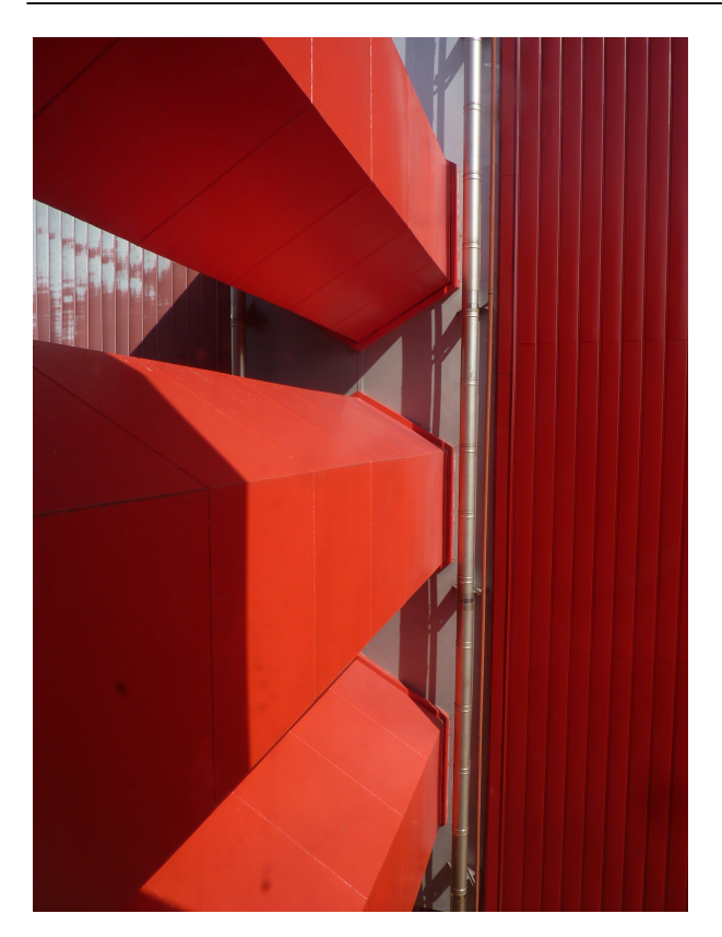
FIGURE 5. Telecommunications building in Hradec Králové in detail.

As already mentioned, this technology was very demanding in terms of cooling requirements, and this problem was also reflected in the architecture of the telephone exchanges themselves; in addition to the internal layout, the overheating solution was also reflected in the façade. The classic thermally insulating Boletice style façade was preceded by the so-called "radiation envelope", that is, a double façade with mechanical shutters that could be used to regulate air circulation thus helping to dissipate heat from the building.