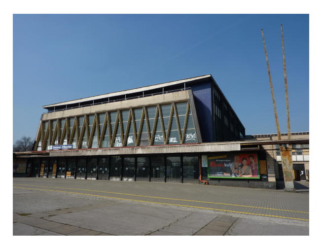
FIGURE 1. Ostrava-Vítkovice railway station.

of a mentioned grant NAKI II. The first one described Ostrava-Vítkovice railway station causa (see Figure 1). One of the chapters compiled at FSv CTU in Prague defines in detail possible approaches regarding thee repurposing of railway buildings which range from minor to major changes, and from single purpose to those with a wider variety of function. In the Czech heritage care these possibilities has not been sufficiently formulated yet even in mentioned methodologies. Oral history sources were very important within this research.