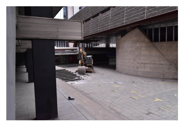
Figure 2. Demolition of Transgas complex.

Within the mentioned NAKI project, Lenka Popelová published an article on the importance of architectural competitions in the development of individual typologies and forms, and Tomáš Šenberger published a paper on the construction of post-war Czechoslovak industry [10]. Some initial findings