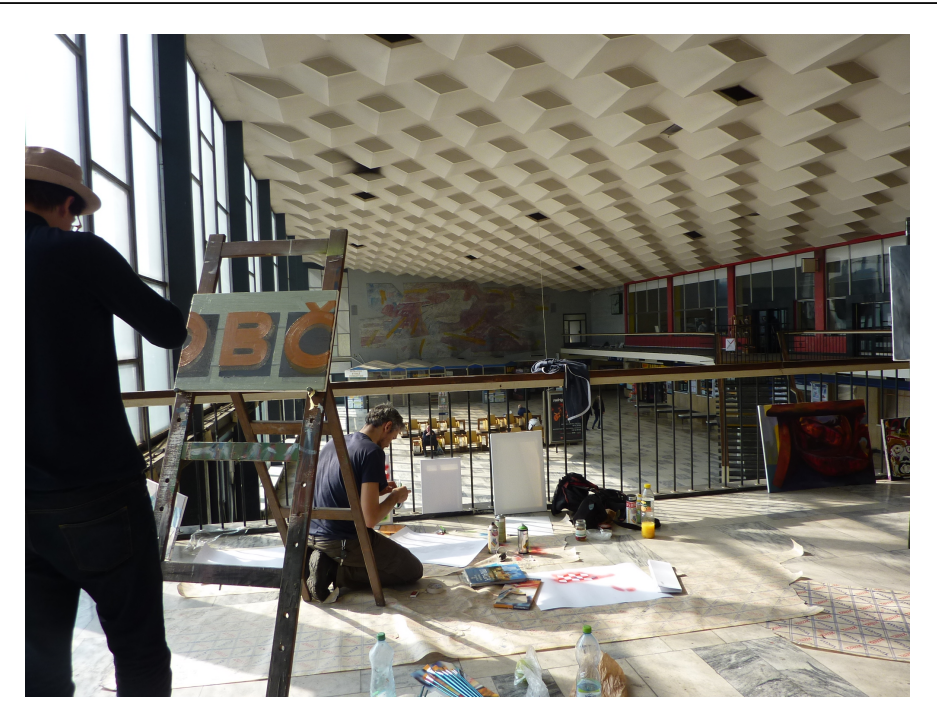
FIGURE 3. Workshop at Havířov railway station.

tative of the 1960s Brussels style architecture. The station's passenger building, which is decorated by artworks from Vladimír Kopecký and Václav Uruba, was integrated into the fabric of the city and became part of the everyday life of its residents. For many years it served its purpose bringing a unique experience to many passengers. The lack of care for the building and its surroundings, together with the high energy consumption of the premises of generous dimensions, resulted in the proposal to rebuild the railway and bus transport hub. The selected design no longer factored in the iconic construction of the passenger hall. Underestimation of the values of the existing building, inappropriate design concept, a lack of discussion among the public, as well as architectural competitions contributed to the coalescing of a movement of experts and activists in an attempt to save the passenger building of the station.