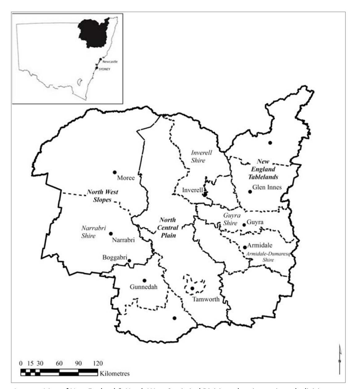
Figure 1: Map of New England & North West Statistical Division, showing major sub-divisions

Narrabri, grew more slowly (14.5%). Over the same period, each major region's population share shifted little: an approximate two percentage point decline for the North Central Plain was absorbed by its neighbour, the North West Slopes. Surprisingly, levels of urbanisation remained largely unchanged. In 1961, just over 65% of the SD's population resided in towns or other urban centres; by 2011 this level had increased only slightly to 66.5%. Throughout the 1980s and 1990s, though, the New England & North West SD experienced a period of slow, persistent population loss (see Table 1). For the remainder of this paper, I explore: (1) the spatial unevenness of demographic dynamics within the region since the 1990s; (2) the key demographic drivers of regional and sub-regional population change, including net decline; (3) the extent to which key drivers provide an indication of future demographic change; and, finally, (4) the extent to which these demographic indicators have manifested themselves differently for Indigenous and non-Indigenous populations within the region, to the extent that data permit.