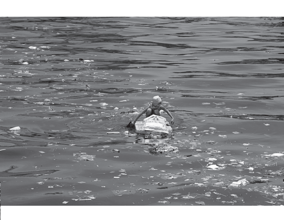
Boy on makeshift raft – Manila, Philippines. Young boy wades through garbage on a river in hopes of recycling his way out of abject poverty.