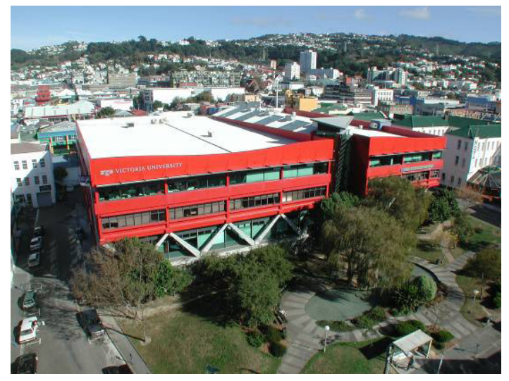
Figure 1: Victoria University's Faculty of Architecture and Design.

Since 1997, a specialist elective course in Sustainable Architecture has been offered. This course is open to all students in the University beyond