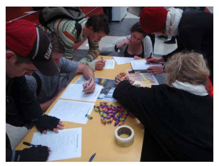
Figure 3: Collection of student opinions at student initiated solar tube exhibition designed to encourage faculty management to install solar tubes to reduce lighting energy consumption while improving the quality of some interior spaces.

stamped their own permanent logo onto the bottom. This stamp was easily identifiable and to try to start a trend, cups were given away to well known and respected staff and students on campus. The rest of the cups were sold for a small fee to cover costs in a festive event in the main atrium of the campus, drawing attention to the initiative. Students documented the process through photography and drawings and for the final part of the project, transformed their collected images and designed logo into posters. These were put up around the campus and at the cafes. Figures 3-5 illustrate some of the interventions that other groups of students devised.