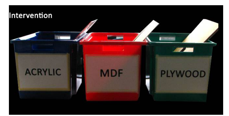
Figure 4: Material reuse station designed to reduce laser machine off cuts and save students money. This was combined with banners and information posted on computers for how to cut materials efficiently when using the laser cutting machine.