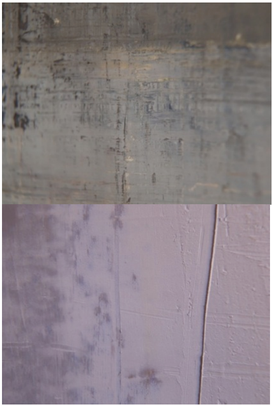
\hbox{`Figures 17,18,19,20\&21. Still frames from the film ``Parallel Architectures'' - Sequence based on real-time documentary. Oil painting on paper . Author (2017)'}