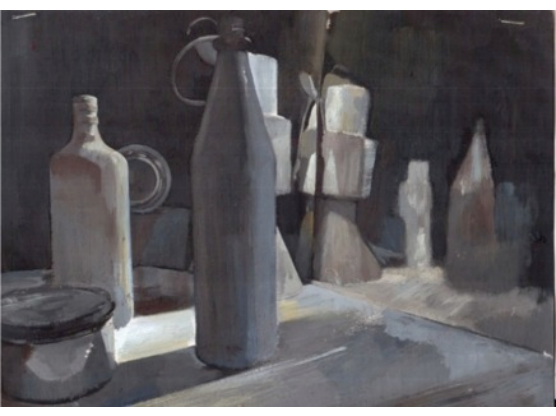
'Figures22,23,24&25. Still frames from the film "Parallel Architectures" -Sequence based on real-time documentary. Oil painting on paper . Author (2017)'