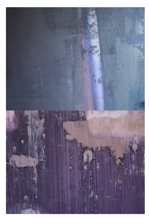
\hbox{`Figures 15\&16. Still frames from the film ``Parallel Architectures'' - Sequence based on real-time documentary. Oil painting on photograph. Author (2017)'}