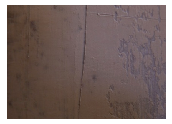
'Figures26&27. Still frames from the film "Parallel Architectures" -Sequence based on real-time documentary. Oil painting on photograph . Author (2017)'