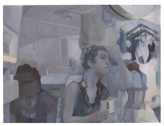
'Figures 11 & 12. Still frames from the film "Parallel Architectures" – Sequence based on real-time documentary. Oil painting on paper. Author 2016-17'