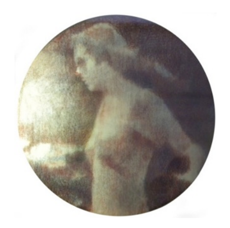
\hbox{`Figures 5,6,7,8,9\&10. Still frames from the film ``Parallel Architectures''. Sequence based on cinema archive . Colored pencil on mylar. Author 2016'}