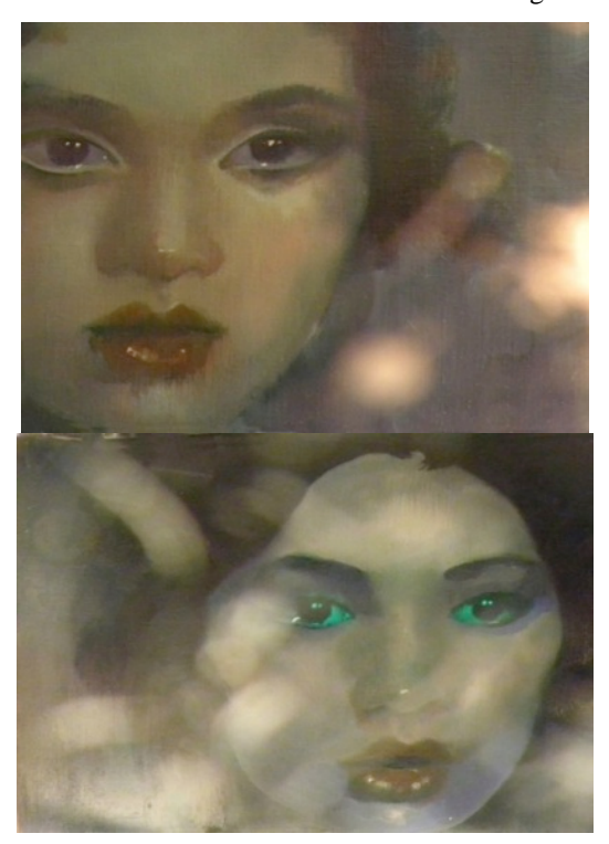
'Figures 1 & 2. Still frames from the film "Parallel Architectures" - Sequence based on cinema archive. Oil painting on canvas and cells . Author 2015'