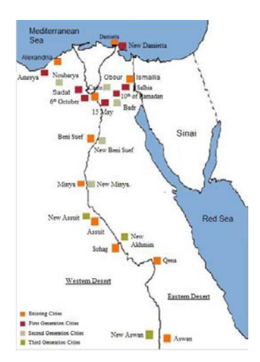
Figure 2: an Illustrative map for the distribution of new cities in Egypt, according to three generations.