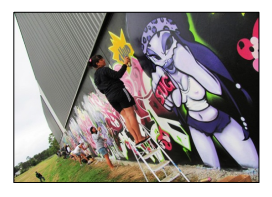
Figure 3. A "Stick Up Girlz" mural, Australia 2010

Lucy R. Lippard (writer, art critic, activist and curator from the United States) argued in 1980 that feminist art was "neither a style nor a movement but instead a value system, a revolutionary strategy, a way of life." This quote supports the fact that feminist art affected all aspects of life.