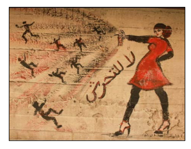
Figure 7. "Nefertiti" by El-Zeft Cairo, 2012