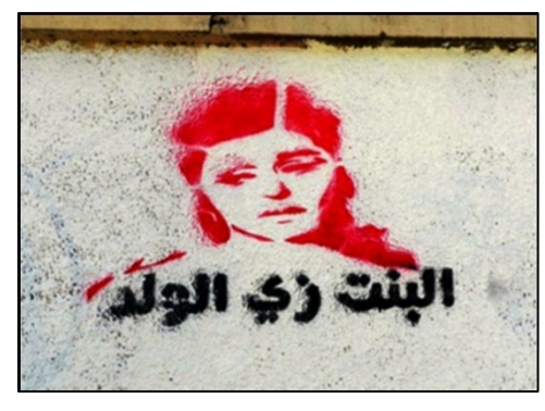
Figure 10. Long live Free Egypt