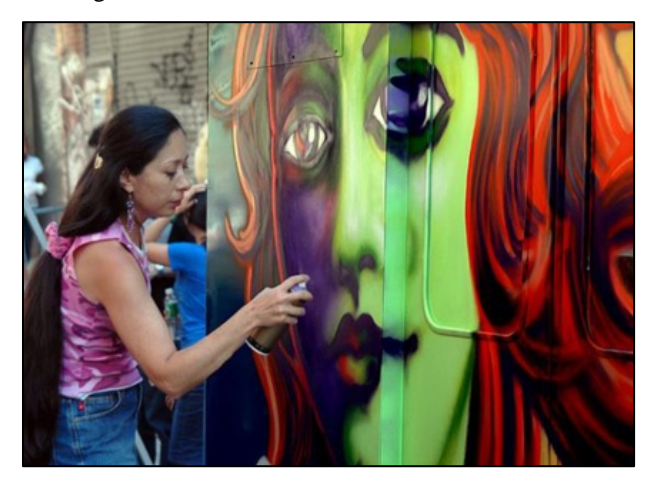
Figure 1. Lady Pink, Graffiti artist.

Not too far from the previously talked about history of the feminist art movement, actually, within the 2<sup>nd</sup> feminist wave, in the late 1970s, Sandra Fabara or as known Lady Pink or "first lady of graffiti" originally from Ecuador, has been known as one of the first graffiti and mural female artist based in New York City, (figure1).