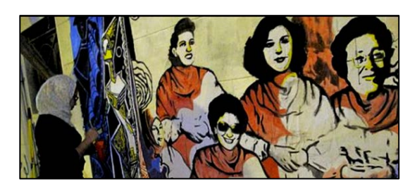
Figure 13&14. Mural paintings executed within the activity of the "Lady of the Wall" project.