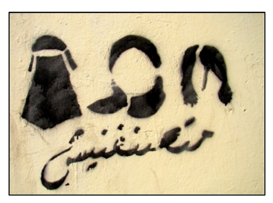
Figure 12. Don't label me graffiti

One of the most brilliant graffiti of the "Noon El Neswa" organization is the one on which was written "Don't label me". The secret of its brilliance is that it touches upon a taboo in Egypt which caused a kind of negative discrimination between the girl who wears a veil and the girl who doesn't wear it, as if the one who puts it is a decent girl, while the one who doesn't is an indecent one. Not to mention that the girl or woman who puts the face burqaa is considered by others as an extremist. This graffiti calls for stopping this kind of pre-judging people especially women based on their costume, which is from the researcher's point of view, very important to talk about visually (Figure 12).