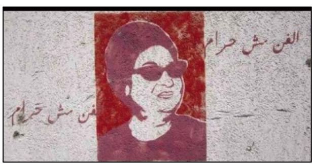
Figure9 . Art is not forbidden