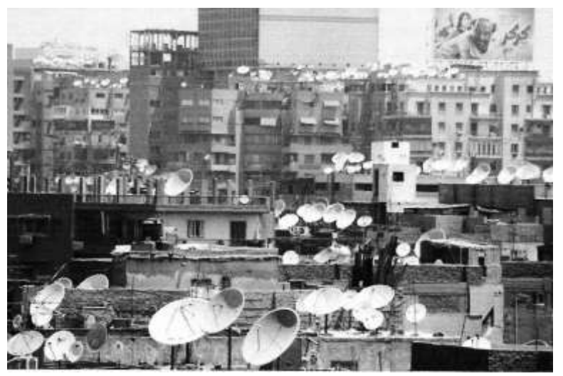
Figure 14 Satellite dishes and advertisement billboards situated on the rooftops of residential houses

Significant changes occurred in the appearance of the rooftop, which is a key, or an effective factor in determining the relationship between mass and spaces. The good design of the rooftop determines the shape of the building and contributes to drawing the skyline, which strengthens and highlights the identity of the city. The rooftop of the modern buildings flattened in conjunction with crowdedness and poor planning which had a significant impact on the morphology of the Egyptian city. The technological progress of the communicational means and the control of capitalism have played a major role in changing the shape of the buildings' rooftops. Satellite dishes and colorful advertisement billboards had irregularly settled on the rooftops of the houses (Fig. 14) to form unflatten building shapes.