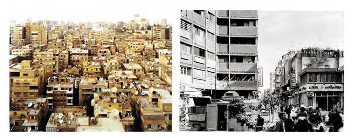
Figure 12 The cowdedness of modern buildingsin Cairo