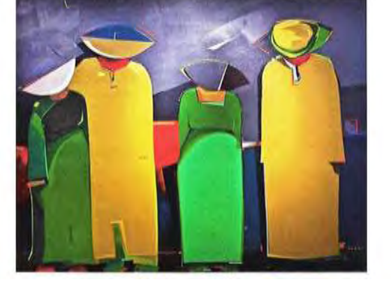
Figure 34 Gihan Soliman, acrylic on canvas,180x200 cm,2012

On the same critical point of view regarding the changes that occurred, Artist Jihan Soliman made a series of works that depends on modern construction in its formations. It criticizes the spread of the satellite dishes on the rooftops. Sometimes, she portrays it in an abstract way that covers only the buildings (Fig. 33), and other times, she portrays people themselves like buildings with their heads taking the form of a dish (Fig. 34). In another style, the painting of artist Nevin Rifaee (Fig. 35) reflects the spirit of the contemporary or modern city. She expressed that by drawing a realistic picture of the flyover amidst Alexandria Corniche recently (Fig. 18). Also, she used her artistic sense in a way that relied on contradictions of pure colors. She mixed the ground hot red with yellow touches as an expression of the uproar of the street; opposed to the shades of the blue cool sea, splashed with sporadic and trembling touches on the two parallel directions, to convey the movement and the tension of the sea. It was emphasized by selecting the birds' eye as a perspective angle of her painting, influenced by the style of high-rise buildings and the vertical extension of the modern city. Its major purpose is to deepen