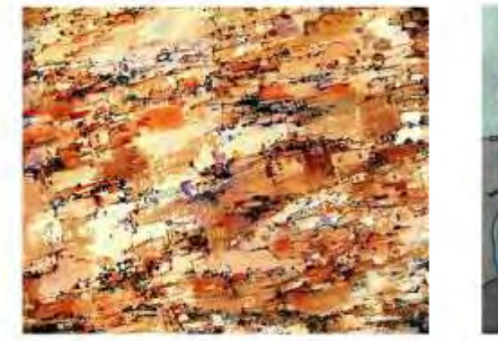
Figure 25 Salma Abdel Aziz, Rythms,Oil on canvas,120x120 cm,1991