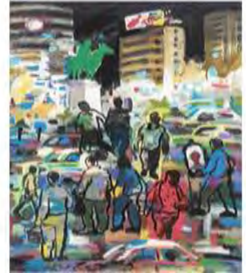
Figure 21 Mohamed Abla, The square of Ibrahim Pasha, acrylic on canvas, 100x80 cm ,2004