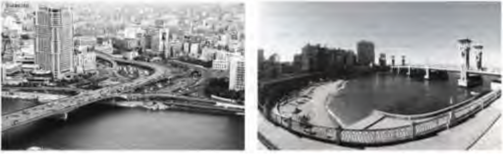
Figure 18 The network of bridges in Cairo