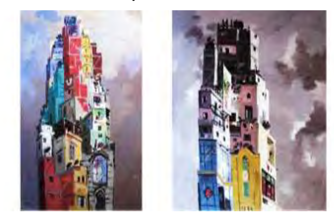
Figure 19 Mohamed Abla , Towers of Cairo, acrylic on canvas,180 x 160 cm ,2010

question summarizes the artist's vision, which is reflected in his works and is affected by watching the city's current image. The artist had deprived the city of its ugliness and introduced its elements in an expressive artistic image, showcasing how the artist is influenced by it.