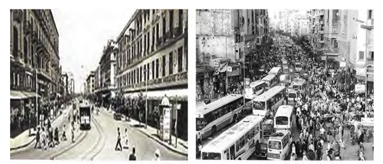
Figure 15 One of Cairo's streets in the early 20th century