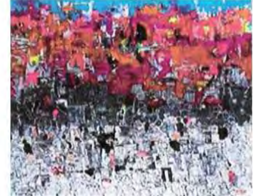
Figure 22 Ahmed Farid, beyond closed door, acrylic on canvas, 2016

As Abla has introduced contradictions of the architectural style in the city, he highlights the phenomenon of crowded cars and people on the streets in his painting (Fig. 21). In that painting, Abla features one of downtown Cairo's squares, which are full of cars. People occupy three-quarters of the painting. The artist showed a perspective vision relying on the multiple levels of the ground demonstrating the interdependence between the elements under conditions that did not conform to the laws of the spatial dimension of the passers-by and their relationship with the cars. The artist used multiple- transparent colors' technique and contrast of red colors at the bottom of the painting against the green statue at the top. It highly reflects the congestion and traffic chaos that appear in the real image of the city (Fig. 16). A different style was used by the painter Ahmad Farid covering the street of the city in his painting (Fig. 22). The painting is divided into several horizontal levels where the ground level does not appear. Each of the other levels has its own color and demonstrates its integration through various linear relations that were interacted to paint forms of multiple elements for buildings and characters in a way that made it look distinctive. The painter utilizes small tracts of colors in all spaces to achieve balance, unity and to confirm the congestion of the place.