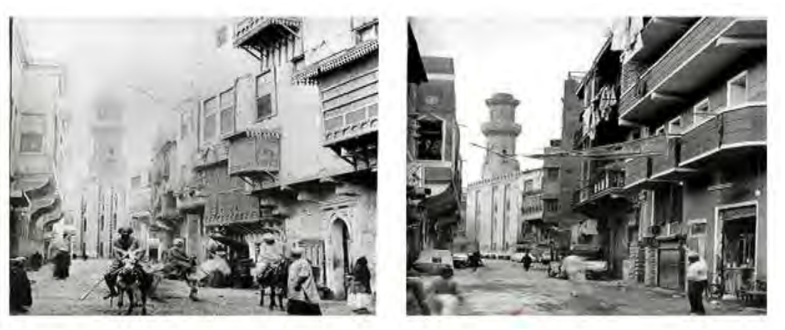
Figure 10 Fatimid Cairo in the 19<sup>th</sup> century