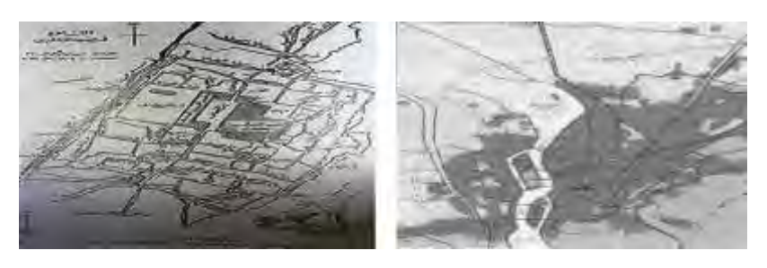
Figure 1Figure 2Cairo's old planningCairo's modern planning

Reham Sherbiny / The Academic Research Community Publication