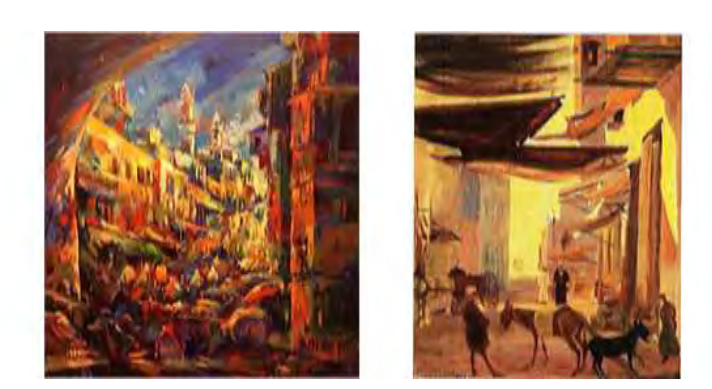
Figure 27 Emad Rizk , Street from Fatimid Cairo, acrylic on canvas ,100 x80 cm, 2016

However, they did so in a different way than before, reflecting how the contemporary painters were influenced by the contemporary urban design even if they used the same old items. This appears in the artwork of artist Imad Rizk (Fig. 27) when he drew Fatimid Cairo in the 21<sup>st</sup> century compared to the painting of artist Shaaban Zaki (Fig. 28) that was drawn in the first half of the 20<sup>th</sup> century portraying the same area. We have noticed in the first painting the hot pure colors, with its contrasts that overwhelmed the artwork. The painter used the colors with multi-directional brush touches to give the bustle feeling and the sense of continuous movement as well as to reflect the dynamic nature of the crowded city. At the same time, the painting merges the elements of the area including buildings, characters, and animals to prove the feeling of crowdedness that has characterized the current city. This goes in contradiction with the painting of Shaaban Zaki , which is dominated, by neutral colors and their gradations in wide spaces. Aside from representing the ground as an independent entity away from the architecture of buildings, it reflects the quietness and placidity of old city.