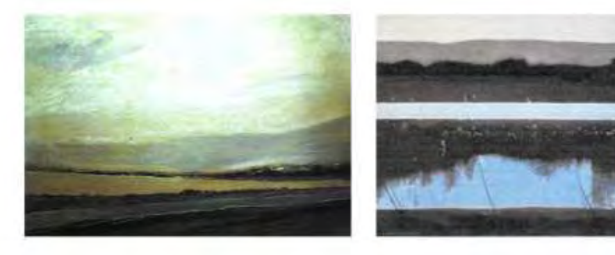
Figure 29 Amany Fahmy, Borqash in Giza, oil on wood 90x60cm,1996