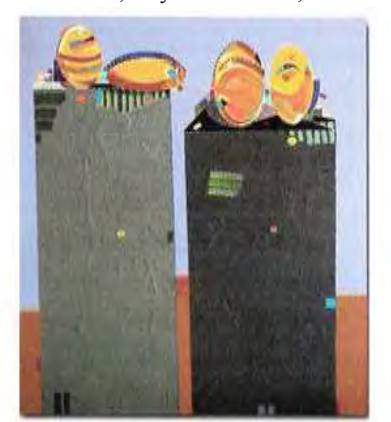
Figure 33 Gihan Soliman, acrylic on canvas,60x80 cm,2009