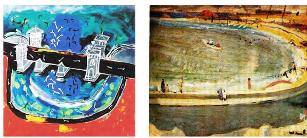
Figure35 Nevin Rifaee, the spirit of Alexandria, acrylic on canvas, 2011

the vision. Fishes are scattered on parallel lines to convey its tumbling from the top to the bottom by the waterfall. It animates the movement of the sea and completes the white-black colored circular composition on the front of the painting to match the colors of the asphalt-made pavement. In addition to that, the two towers of the flyover outlined with a white color appeared as if they were covered with a transparent glass containing the water of the sea inside it. Such a contemporary artistic image was in contradiction to the paintings of the same area portrayed by Alexandria, an artist in the 1950s. For example, painting of Adham Wanli (Fig. 36) shaped wide spaces with close-shaded neutral colors to reflect the calmness and spaciousness by using a much lower angle of vision than that of painter Nevin who painted other works to emphasize the horizontal extension of the place, free from any bridges. The black asphalt paved road, which made his painting comparable with the shape of the city at that time was also another constraint left by the artist in a liberal way.