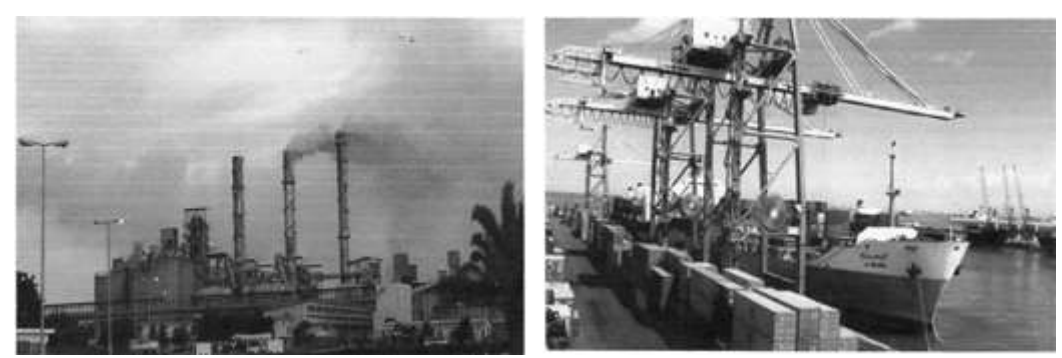
Figure 4 Cement Factory in Alexandria

Figure 3 Incomplete buildings at agricultural lands distorting their image