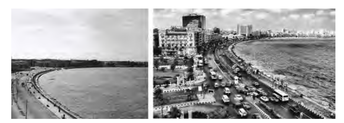
Figure 8 Alexandria's beach in the past