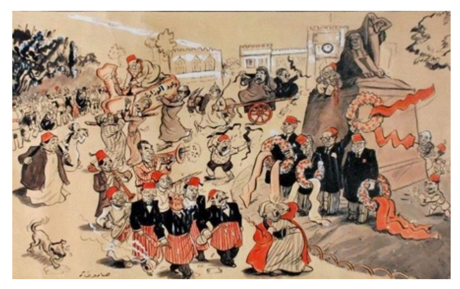
Figure 6 One of the caricature artist Two Missiles

Figure (7) through which the artist expressed his interest in the conditions of his homeland through his art and he did this using a single color and simple lines in the background of the work to illustrate the Egyptian architectural identity by choosing elements of the distinctive architectural environment. Formal construction as a whole to focus on the expressive value of spaces and blocks and lines.