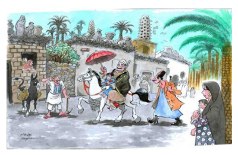
Figure 1 One of the work of the Artist Ali Tuygan

Figure (2) There is no doubt when you see this cartoon work of the artist, Tuygan, one can sense the atmosphere of the Egyptian village by the artist's drawing of the background of rural architecture, which reveals the features of the atmosphere of the Egyptian countryside. This, in turn, makes use of the expressive features of the simple architectural form of the Egyptian village.