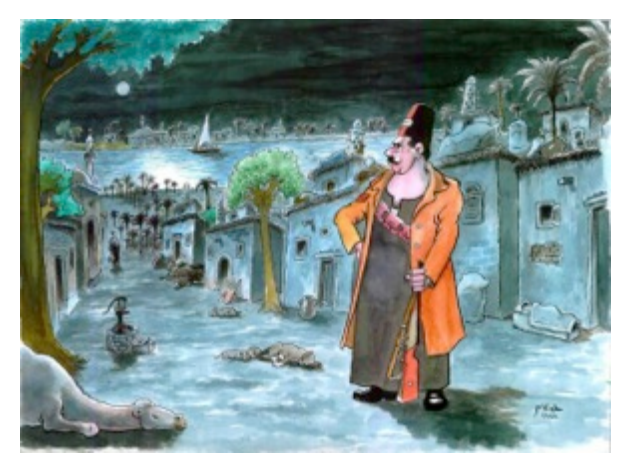
Figure 2 One of the work of the Artist Ali Tuygan

Figure (2) There is no doubt when you see this cartoon work of the artist, Tuygan, one can sense the atmosphere of the Egyptian village by the artist's drawing of the background of rural architecture, which reveals the features of the atmosphere of the Egyptian countryside. This, in turn, makes use of the expressive features of the simple architectural form of the Egyptian village.