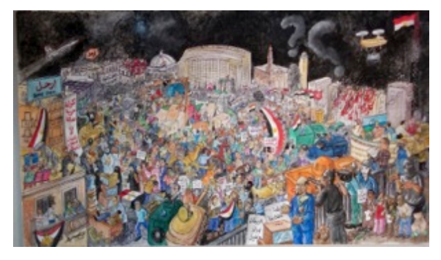
Figure 3 a caricature shows the revolution of 25 January the artist Ibrahim Hnetar

Figure (3) the artist portrayed the Egyptian January 25<sup>th</sup> revolution of 2011 by putting in elements that symbolize the iconic architectural buildings that make it distinct. The artist also used a background full of architectural features that confirm that the revolution was in Tahrir Square.