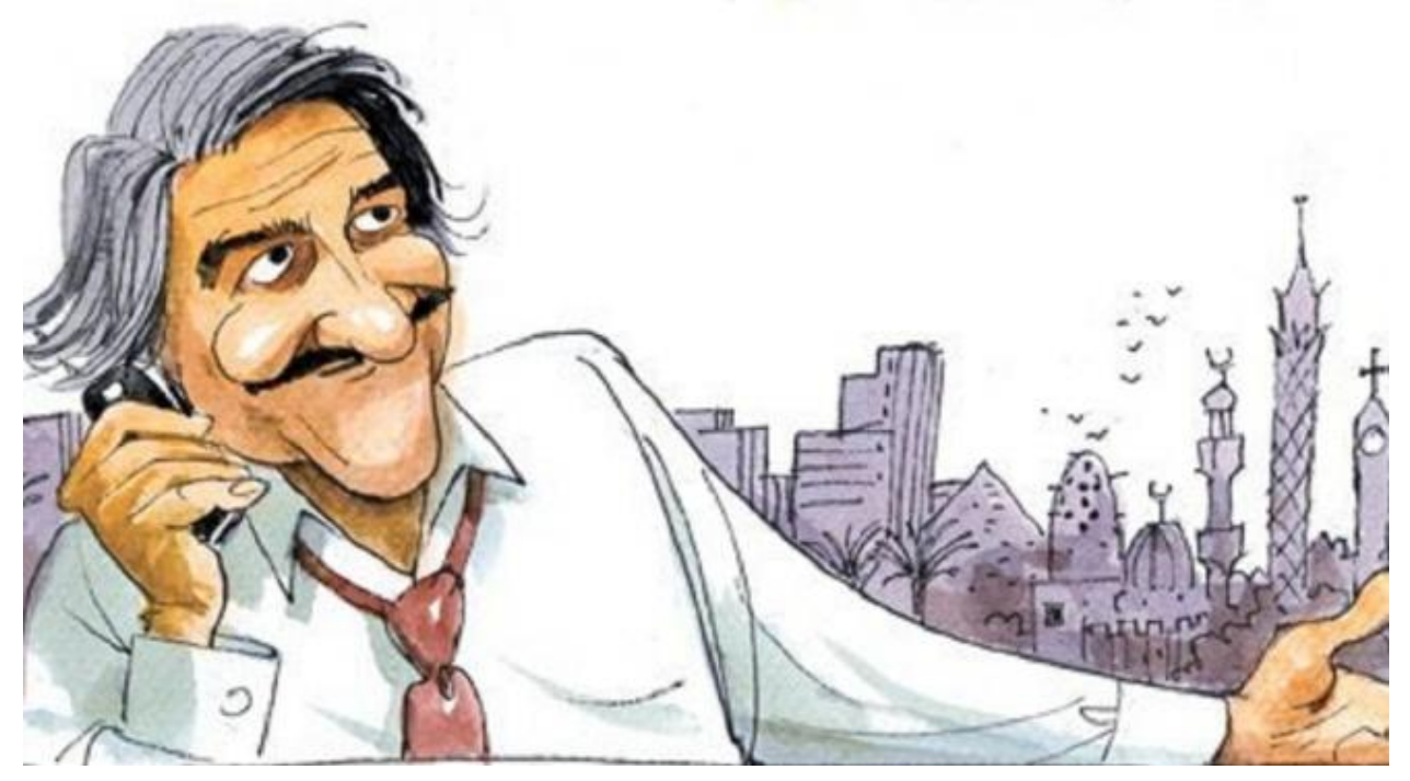
Figure 7 the work of the Artist Mostafa Hussein

Figure (7) through which the artist expressed his interest in the conditions of his homeland through his art and he did this using a single color and simple lines in the background of the work to illustrate the Egyptian architectural identity by choosing elements of the distinctive architectural environment. Formal construction as a whole to focus on the expressive value of spaces and blocks and lines.