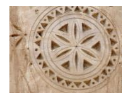
(Figure. 9) A plaster decorated unit common in the heritage architecture using the Najdi style

The artist kept in the Idrisi state period had kept the heritage character that distinguished Jizan region and despite being influenced by previous arts, he was able to incorporate between the different artistic styles, and thus appeared the asterisk plates with the high relief hexagonal and pentagonal petaled ornaments that were shaped inside low relief circular