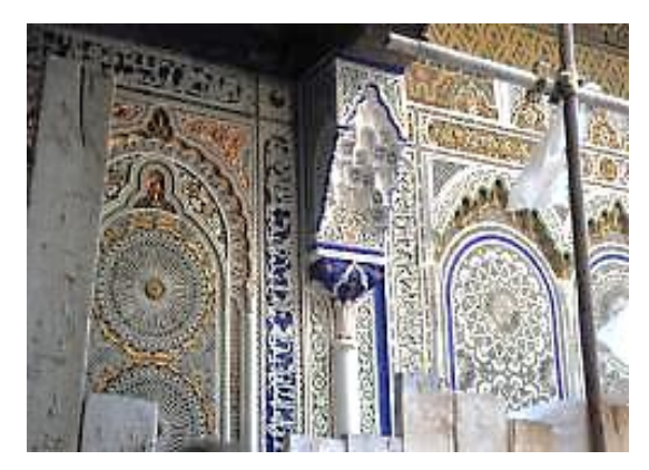
(Figure. 4) a detailed plaster decoration in Mawlay Idriss II Zawya, Fez city, (5th AH/ 10th AD)

The Muslim artist was skilled in at geometric and arithmetic sciences, inspiring from the asterisk plates in the Barbaric heritage arts, many innovative polygonal forms of asterisk plates (fig. 4) as in Mawlay Idriss II Zawya in Fez city. The plaster artist also dealt with the units of the wall decoration elements such as those used in the window openings (sunshades) which became similar to the solid wall windows, decorated with curved broken arches with stalactites, pillars and calligraphic streaks, showing his creative art meticulously through his skilled evacuation of the decorative units, and painting some of them with bright red, blue and golden colors.