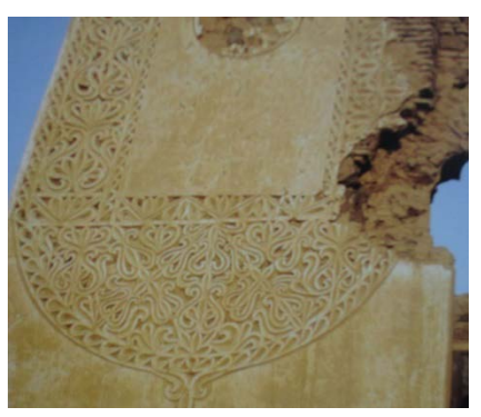
(Figure. 14) Details from the gate at Sebya, Idrisid Era 14<sup>th</sup> AH/20<sup>th</sup> AD