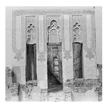
(Figure. 12) A façade of an Idrisid House in Jizan (14<sup>th</sup> AH/20<sup>th</sup> AD)

The architect was not approved at that stageon using the architectural arches as much as shaping the wall decorations in hollow and decorated arches, keeping the simplicity of the primary lines of architecture as in (Figs..7,8,10,11&12) thus the arches looked solid suggesting door and window slots on the full length of the facades and its greatness. The facades of the Idrisi palaces were designed as a main door located at the front of the building front characterized by its height, and located in the middle between two narrow windows that nearly the same height and were located on both sides, and it is thought to be the influence of a Turkish design, it spread in different parts of the Arabic peninsula such as AL Riyadh, Jeddah and Medina where a frontal area was added to it to sit in during summer.