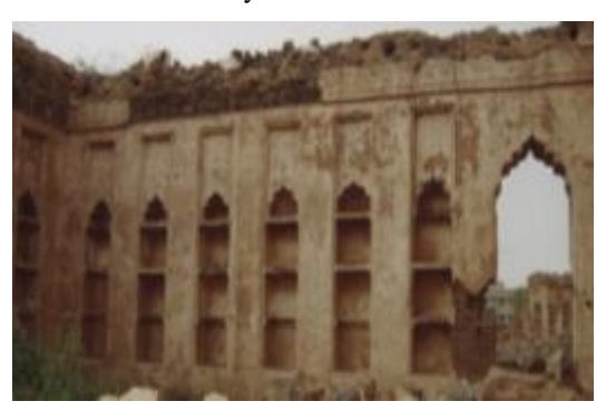
(Figure. 17) Inner wall closets with broken arches, an Idrisid Palace 14th AH/20th AD

The plaster attractive elements of the ruins of Idrisid palaces and buildings were similar to those of the Umayyad's in the plaster engraving and hollowing method after drying and the motifs protrusion from the background with twisting and interlacing plant lines to cover most of the wall surface. However, the Idrisid motifs in this stage were formed of a group of plant stripes hollow in the insides and all around, also the decorative design was formed of wide and hollow plant stems surrounded by a frame formed of a part of this foliate heads, it also showed a multi-petaled flower that appeared in the Fatimid and Abbasid motifs and moved to the heritage architectonic style in Najd region, it is worth mentioning that in the primary stage some motifs of the Sasanian and Byzantine art methods overwhelmed (fig.16).