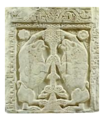
(Figure. 16) A granite slab from the Byzantine era, engraved with decorative units (11-12 AH) Christian and Byzantine Museum

Those decorations extended from the building summit and ended in plant motifs that looked like rattles, mostly inspired by the Ottoman and barbaric heritage plant motifs.