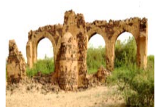
(Figure. 5) Ahmed bin Idriss Mosque in Jizan 14th A.H/ 20th AD

Imam Muhammad bin Ali al-Idrisi founded Sebia city in the year (1338 AH) as it was located on the north-eastern part of Jizan city. It was divided into two partitions, the old city and the new city near the Red Sea coast.