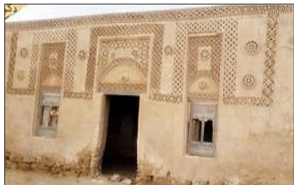
(Figure.6) Najdi style decorated plaster, the idrisid period 14th A.H/ 20th AD