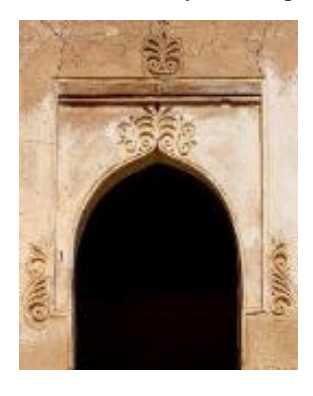
(Figure. 13) A Najdi style decorated plaster, Idrisid Era 14^{th} AH/ 20^{th} AD

As the wall processing of the Idrisi palace facades developed, the decorations with the straight frames developed into curvatures and also broken arches with Asian Persian character were added to it, on the summit of the entries and the windows of these palaces. (Figs.10,11&12) As many and multiple of these contracts and differed in their layers, thus achieving a creative aesthetic value that was not common in this region. The plaster wall decorations took the spirit of the broken arches design and dropped down on its sides, which enriched the visual wall processing through the diversity of high relief and low relief in an alternate way, with breaking the barrier of the straight constructive and building lines that made up the building, we notice in (Figs.10,11&12) the similarity between the broken arches in Sebia's palaces by those of Mawlay Idris II particularly at the top of the keystone (fig. 4).