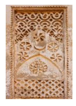
(Figure. 8) Decorated plaster in the Najdi style, Idrisid era 14<sup>th</sup> AH/20<sup>th</sup> AD

The artist kept the visual and architectural modelling as in (Figs.6&7) through keeping the horizontal and vertical lines of the plaster friezes with the straightness of the constructive architectural modeling, while keeping the harmony and the diversity through breaking the repetition of the broken interlacing and curved lines harmoniously and finding solid solutions for the wall surface in a balanced way. The Jizan Idrisi processing of plaster decorations were not as sharp and hard as those of Far Morocco, as it was concordant with the wall, more gradient and low relief (Figs.7,8,9,10,11,12,13&14) rather than being high relief and obtrusive on wall surfaces as in Far Morocco (Figs.1,2,3&4) This was probably due to the proximity of Sebia from the sea coast that had the features of the Red sea arts which were characterized by frescos more than high relief plaster wall decorations, except in some African regions such as Kenya and Nigeria. However the Najdi character had dominated this region, and the Najdi artist kept the nature of wall paint that resembled the paint of the desert and natural rocks.