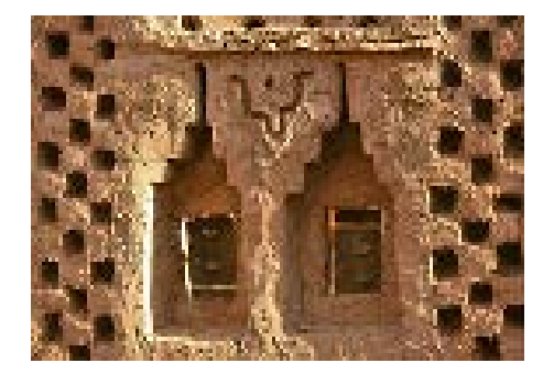
(Figure.3) some of the wall decorations in one of the facades of the Berber towns.

The artist had created genuine plaster decoration elements, inspired by the artistic amazighs heritage units (Figs.2&3) which were spreading on the clay houses' walls in this period, mixing them with the artistic experience that he carried with him since he moved from the south of the Kingdom of Saudi Arabia to Far Morocco, and thus appeared the high relief and low relief lines, and decoration units coming from both heritages mingled with the Ummayyad and Abbasid styles and the inherited arts in this region.