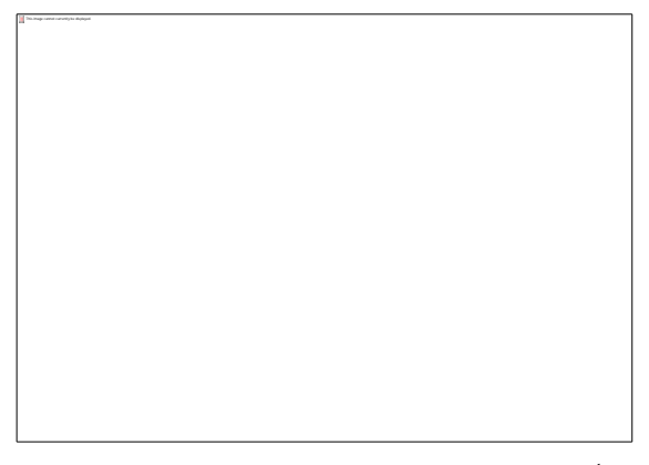
(Figure. 1) Mawalay Idriss IIzawya, the arches are horseshoe shape, Fez city, (5th AH/10th AD) century

containing asterisk plates that were transmitted from the Berber arts. The kufic and thuluth calligraphy streaks were used, as in Mawlay Idriss IIzaywya (small mosque) (figure.4) as a new type of wall decoration which gave the wall a creative and distinctive character.