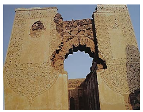
(Figure. 15) A city gate at Sebya, Idrisid Era 14<sup>th</sup> AH/20<sup>th</sup> AD

The plaster artist used the heritage plant units as the palm leaves decorations which were common on the facades of the heritage building (fig.13) as plastic units for the ornamentation of the arch summits which were ornamented in a simple and symmetrical form, he modified this decorative unit using curved and abstract lines which were thin and simple the facades' decorations of the building entries had evolved and were taken care of, influenced by the style of the triumphal gates of the Romanian and ancient Greece buildings, consequently it looked higher and more refined, he also created in the decorative arts where he took care of the arches modeling resulting in the disappearance of the quadrilateral slots which were common in the very beginnings of the Idrisi architecture, thus the arch slots widened, he also took care of the wall plane motifs which were ornamented with vermicular decorative streaks, influenced by the Andalusian decorative style (fig.14) in its duality and arches duplication, also the Sasanian and Indian influences appeared in the wall decoration style, thus it appeared as dropdown curtains like the Indian and Persian rugs that were used in the formal celebrations.