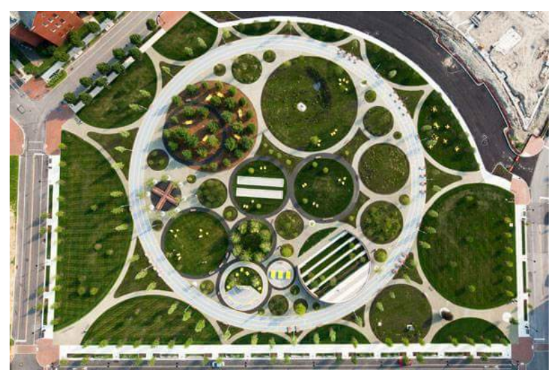
Figure (9) One of the open spaces between the residential area and has been taking into account the different values in the Fine Design

- Lighting and shade: light and shade are important elements in landscaping, this is due to the method and style of its shape and distribution (16).