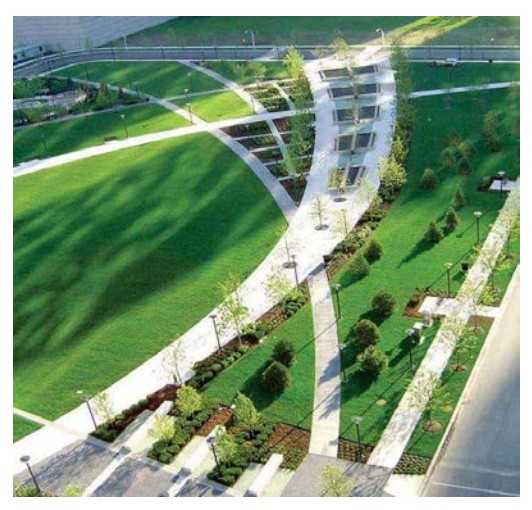
Figure (4) This is the design of one of the open areas between the units urban area were employed plants of different colors and artwork, and environmental and natural materials to create a unique visual spectacle.

Encourage the spread of works of art in the urban spaces of the city provided that it represents a high level of thought and art and enhances the surrounding environment (13).