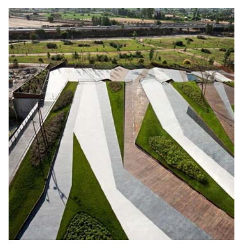
Figure (3) Shows us how we depend on modern materials and new thinking in design

This factor includes several elements from one era to another and from one society to another and it consists of building materials and the techniques followed during construction along with scientific and technological methods. Building materials and construction methods affect the shape and structure of architectural spaces and this is evident in a new building if it reflects the magnitude of its development in its modern building materials, construction methods, and technological techniques. That is also evident when it comes to its large size along with its color and texture (12).