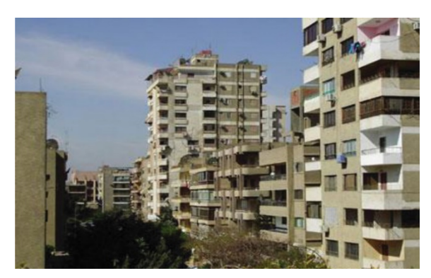
Figure (1) describes the cement forests of the city and the lack of respect for the green areas and privacy of the population along with the lack of interest in protecting public spaces and taking care of building fronts

Muhammad Yunus / The Academic Research Community Publication