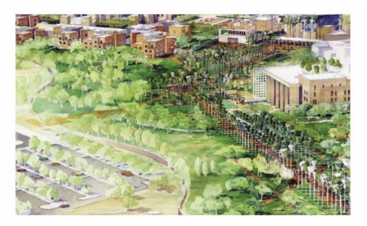
Figure (8) Coordination between different site in entertainment areas and parking facilities and residential buildings