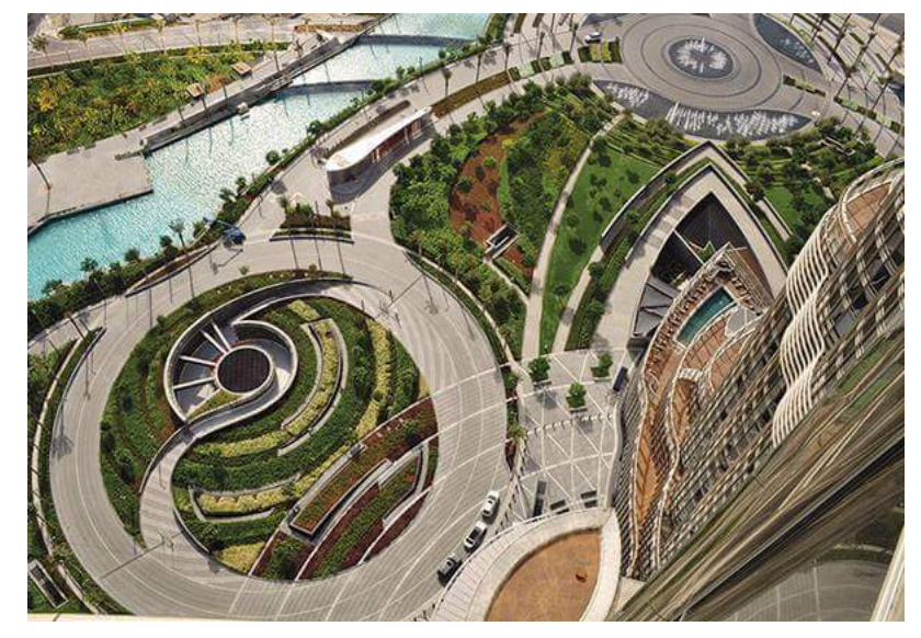
Figure (2) This innovative design illustrates the application of the thought of organic design in the open areas