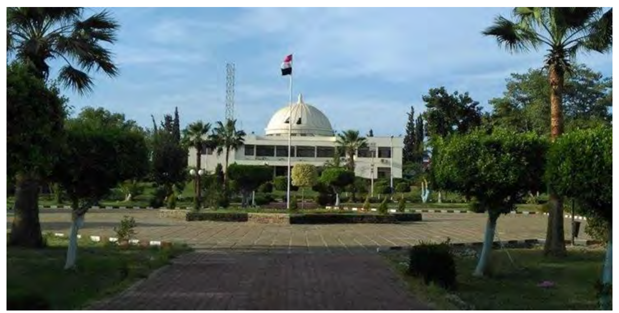
Figure 5. main entrance south elevations

room. Building has a main staircase adjoins a special entrance Prime university, agents and VIP him both sides of the special branch personnel. Based hill height of 4 meters from the level of the university buildings and the main entrance to the building is located on the eastern facade and is located university president's office on the southern facade of the building.