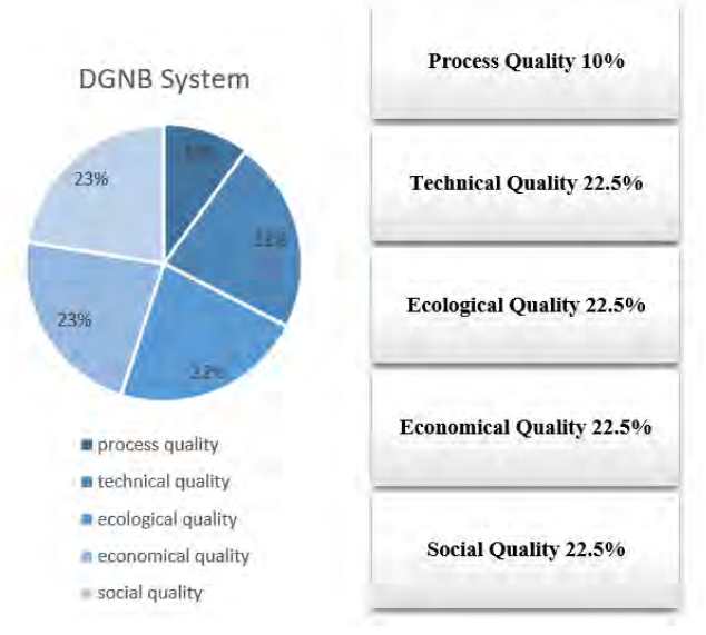
Figure 4. DGNB System

The goal is to create living environments that are environmentally compatible, resource-friendly and economical and that safeguard the health, comfort and performance of their users (The DGNB System: Global Benchmark for Sustainability). The certification was introduced to the real estate market in January 2009. It is now possible to certify at three different levels, "Bronze", "Silver" and "Gold", site quality will be addressed, but a separate mark will be given for this, since the boundary for the overall assessment is defined as the building itself (German Sustainable Building Council (DGNB) General Terms).