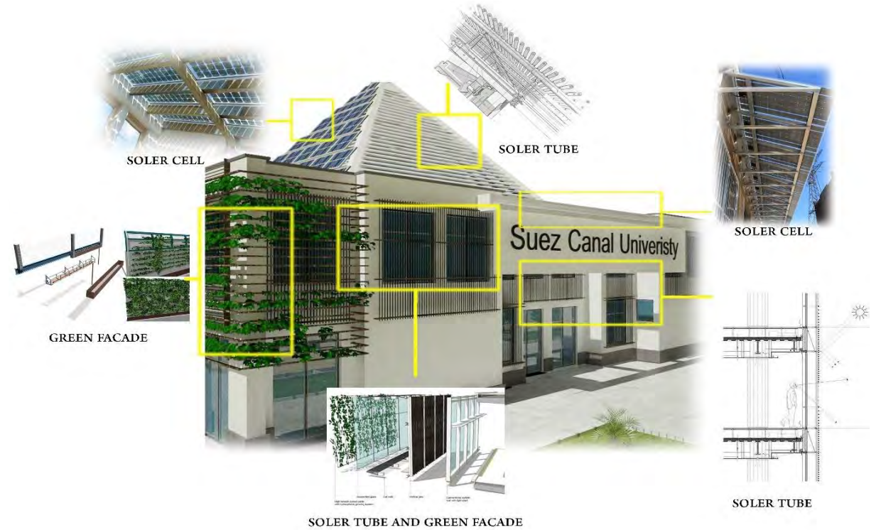
Figure 8. Proposed amendments

Add items to achieve environmental requirements in both southern and eastern façades, as well as addressing the inconsistencies of the elements of the building to be more than one architectural direction, as well as adding elements to generate renewable energy to increase the efficiency of operation in the building.