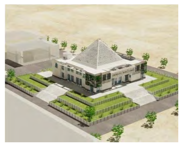
Figure 10. B-south east shot