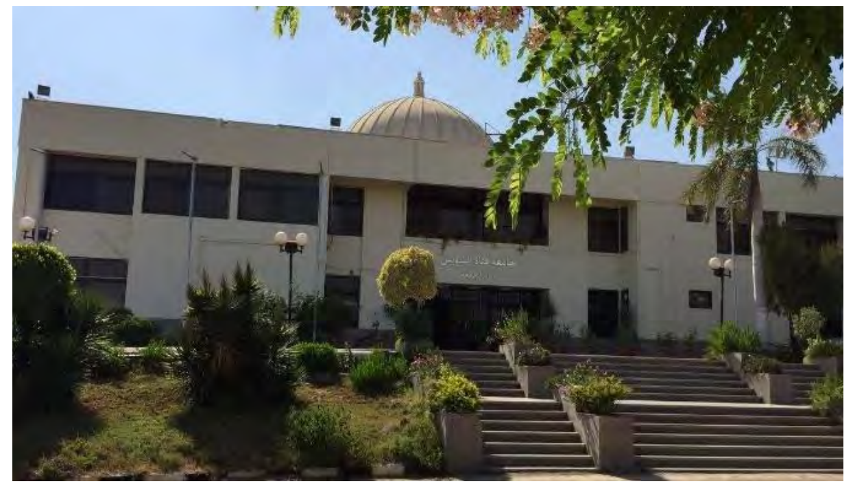
Figure 6. main entrance east elevations