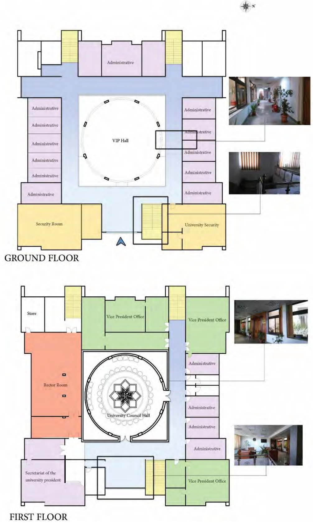
Figure 7. building description plans