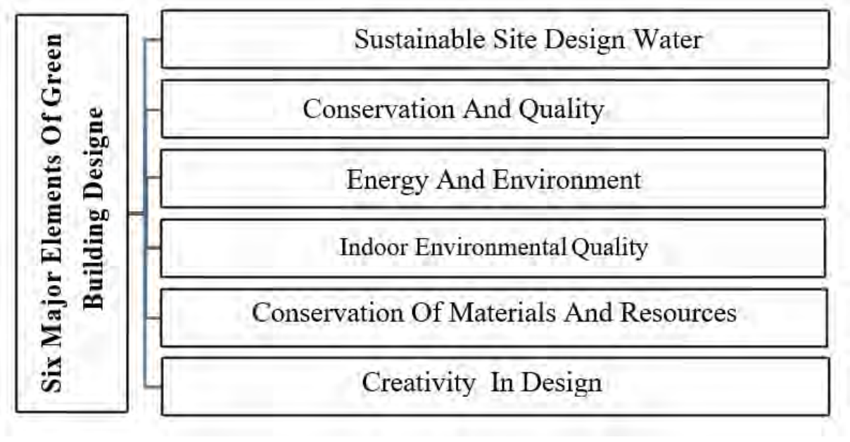
Figure 1. Six Major Elements of Green Building Design