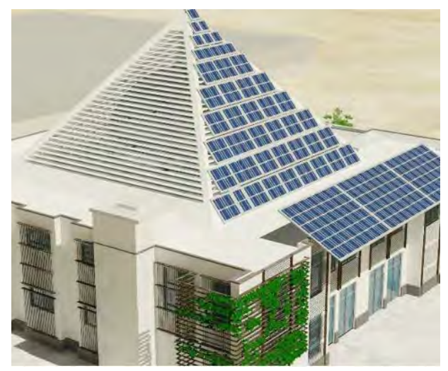
Figure 11. C-west south shot