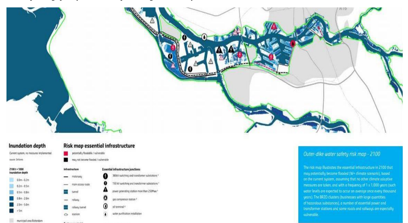
Figure 2. Settings at flood risk, forecast at 2100, indicating the infrastructure at risk.