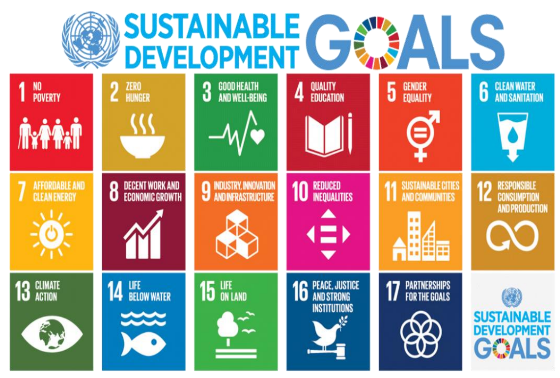
Figure 1 The UN 17 Sustainable Goals (UN, 2020)

from the development of the cultural economy to the interest in the creative industries and the recent debate on the role of culture in sustainable development (Sabatini, 2019).