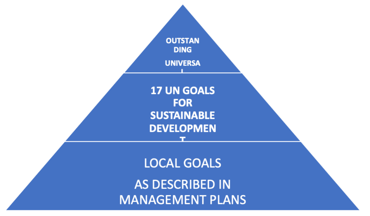
Figure 2 The top-down approach of CORRELATE

In the middle of the figure the 17 SDGs are placed as the basic level of evaluation and classification for the local goals which are placed at the bottom of the figure. For each monument the implementation of each local goal must be first evaluated according to the SDGs so that the higher goal can be achieved and the sustainability of the monument can be ensured. The achievement of this goal is inextricably linked to the satisfaction of every individual goal, as they are reflected in the case-appropriate management plans and they must be reviewed and updated accordingly with current circumstances and developments. The use of in the context of cultural management of world heritage monuments uses their structural characteristics and the completeness of the categorization they offer, covering every aspect and condition for prosperity and improvement of the quality of life as well as measurable indicators for each goal which are described in their sub-objectives (Labadi, 2019).