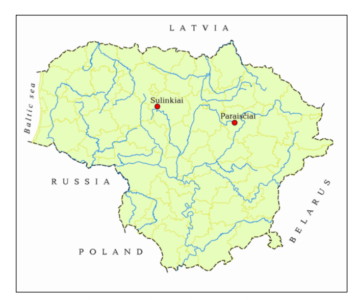
Fig. 2 Map of Lithuania showing localities where Huperzia selago subsp. arctica was found.