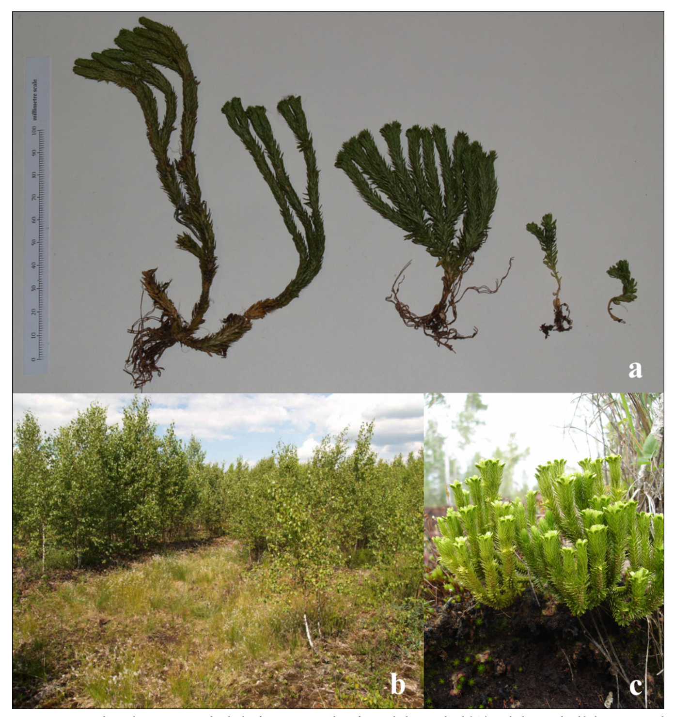
Fig. 1 Huperzia selago subsp. arctica . a Individuals of various size and age from Sulinkiai peatland. b The Sulinkiai peatland habitat. c General view.

Huperzia selago subsp. arctica was recorded from both peatlands (middle of the Sulinkiai peatland and in the western part of Paraisčiai peatland) in a single segment (20 m wide) of the former peat-cutting fields, where peat exploitation was suspended 6-8 years ago.