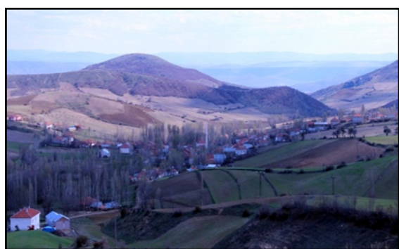
Fig. 2 General view of Kadişehri and villages.

The collected plants were identified by the authors based on the Flora of Turkey and East Aegean Islands [89–91] and Flora Europaea [92]. Voucher specimens were deposited at the Herbarium of Faculty of Pharmacy, University of Marmara (MARE).