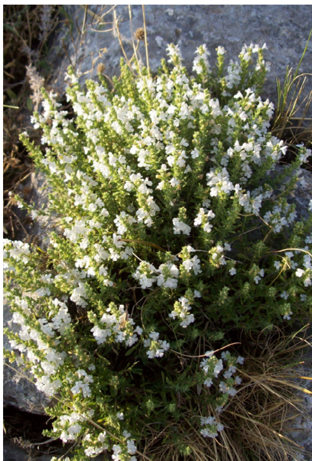
Fig. 3 Satureja wiedemanniana (endemic species to Turkey).

The most frequent type of medicinal use record is shortness of breath (143 UR), stomach ailments (110 UR), rheumatism (109 UR) and wounds (100 UR).