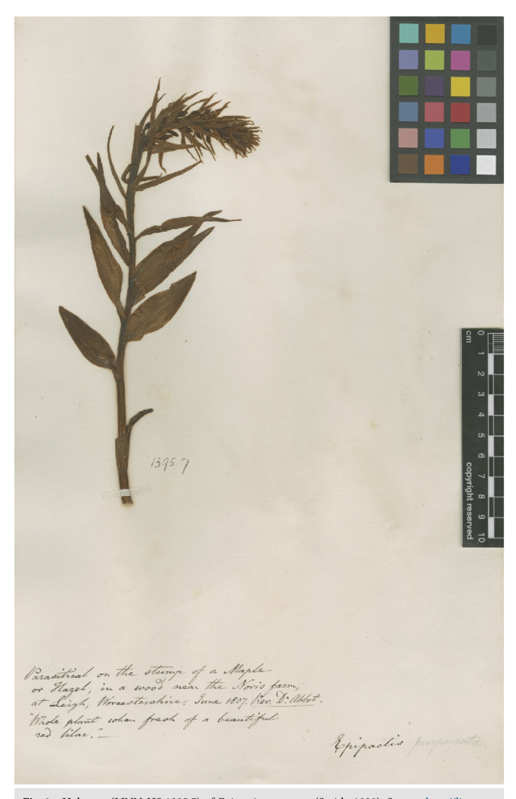
\textbf{Fig. 1} \quad \text{Holotype (LINN-HS 1395.7) of } \textit{Epipactis purpurata (Smith, 1828)}. \textit{ Source: http://linnean-online.org/40493/}