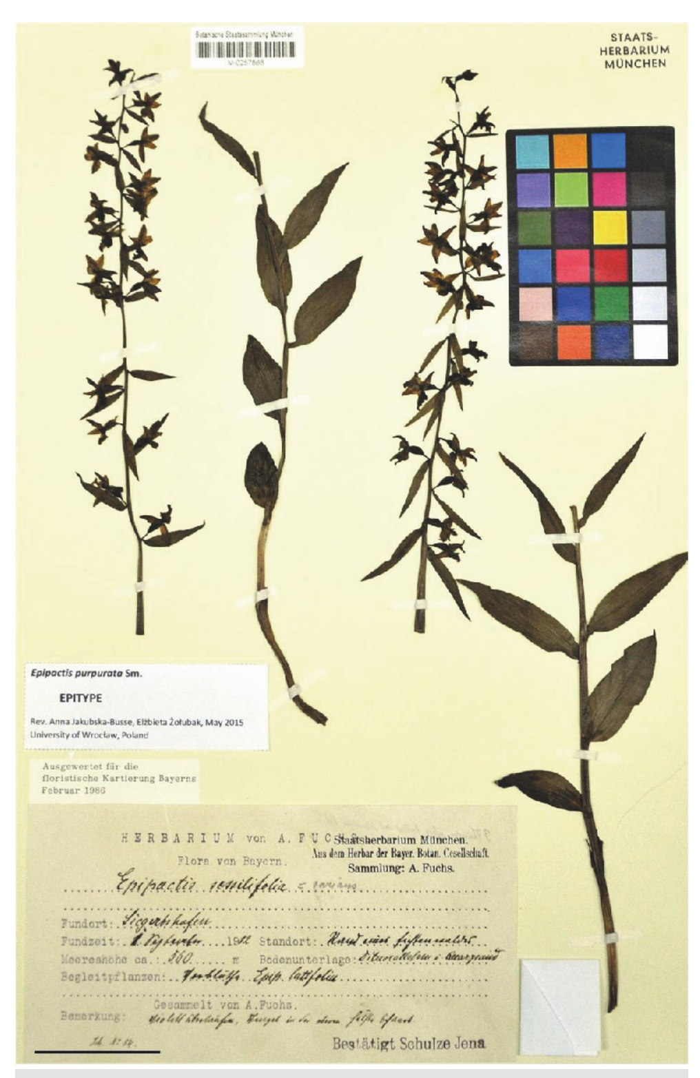
{f Fig.~2} Epitype specimen of Epipactis purpurata Sm. (M 257866). Scale bar: 5 cm.