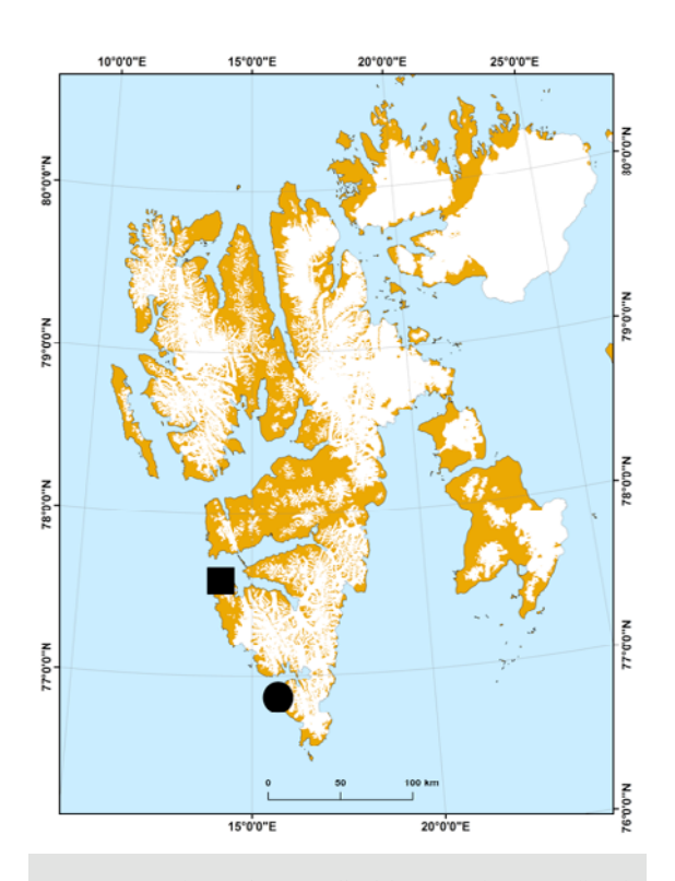
Fig. 1 Localities of Cetrariella delisei samples on Svalbard black square – Calypsostranda, NW Wedel Jarlsberg Land; black circle – Hornsundneset, NW Sørkapp Land.

Until now, the only short-term study for the period of 8 years has been performed on Calypsostranda plain [23] in the NW Wedel Jarlsberg Land; however, the results were not