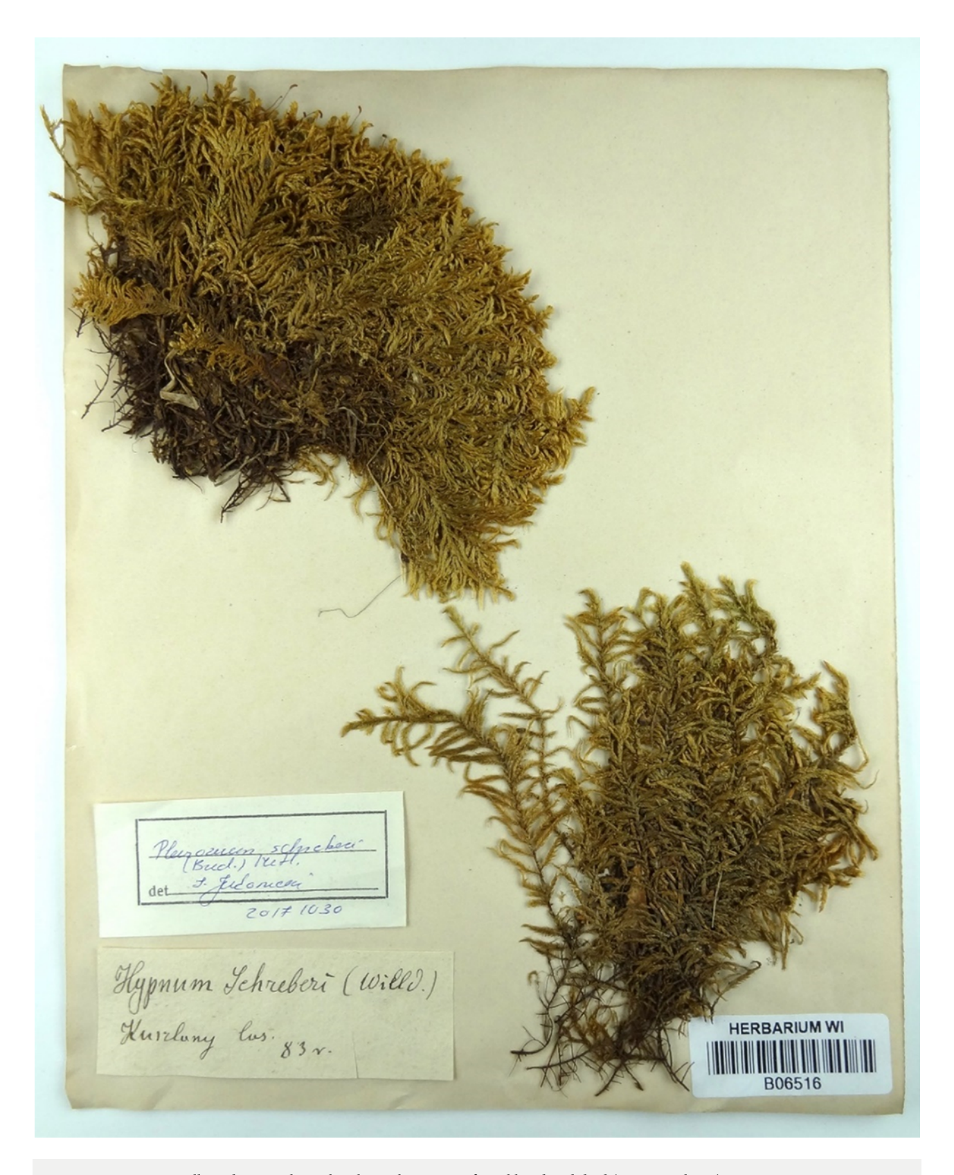
Figure 5 Specimen collected in Kuszlany, the place where K. Szafnagel lived and died (now in Belarus).

on his farthest journey. He visited the Białowieża Forest, Volhynia, Podolia, and the areas west of his place of residence (the environs of Szydłów, Milejów, Pilawa, Wilga, and Otwock). Therefore, the collection covered all territories described in the book (Table 1, Figure 2).