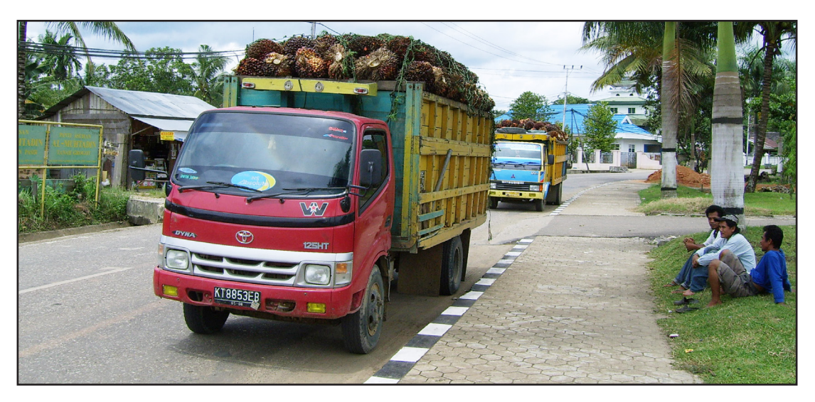
Fig. 3: Trucks loaded with oil palm fruit in Tanah Grogot

to the local population to replant 20,000 hectares of oil palm, including the 2,400 hectares claimed in the PTPN Sawit Indonesia case, and 10,000 hectares of rubber trees under a population plantation ( kebun rakyat ) scheme intended to prevent further conflict and stimulate stability in the district.<sup>18</sup> The tatapraja division was found to be an ideal vehicle both for monitoring the implementation of these and other, private, new plantation projects. Three officials on its staff, an ethnic Paserese and two migrants, were specifically tasked with preventing new conflicts and solving those still in existence. A demanding and sensitive task, as the following example illustrates.