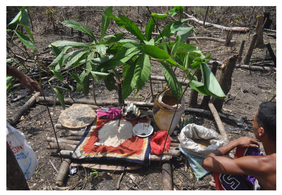
Figure 3: A papag for the diwata, an offering for the intercession of benevolent spirits (Photo by Sophia M. M. Cuevas & Imelda DG. Olvida).

Another ritual conducted on the cleared swidden opens the rice planting activity ( pagpapanggas ) right before the sowing activity ( sungrod ) starts. Before dawn, the farmer heads onto his or her swidden in order to build an altar ( papag )<sup>16</sup> and say some prayers asking for blessings (see Figure 3).