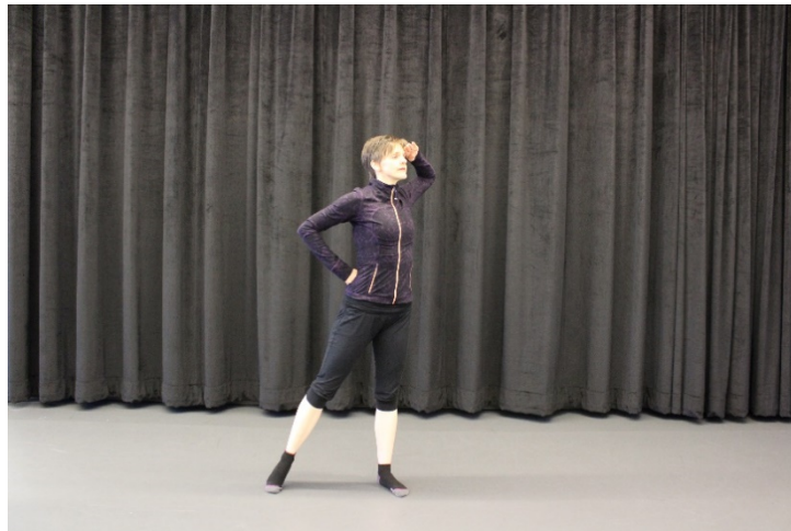
Note. Top panel: “Confident” shape from Session 1. Bottom panel: “Limitless” shape from Session 3.