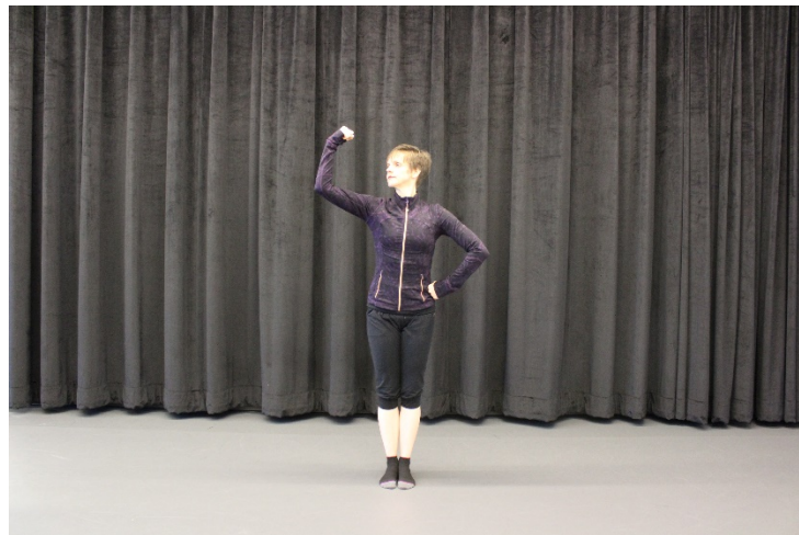
Figure 2. Example Shapes

The first 10 minutes of each workshop session focused on the completion of gentle stretching activities, which were led by the dance specialist with the support of the dance students. Then, the dance specialist along with the dance students progressed participants through the sequence of shapes for approximately 15 minutes. After implementing the sequence of shapes several times, the LCSW implemented mindfulness techniques for approximately 10 minutes. Following the mindfulness exercise, the LCSW led a discussion for approximately 15 minutes. The workshop session concluded with the dance specialist, with the support of the dance students, implementing the same sequence of shapes with participants for approximately 10 minutes. Figure 2 shows examples of the dance specialist enacting two shapes.