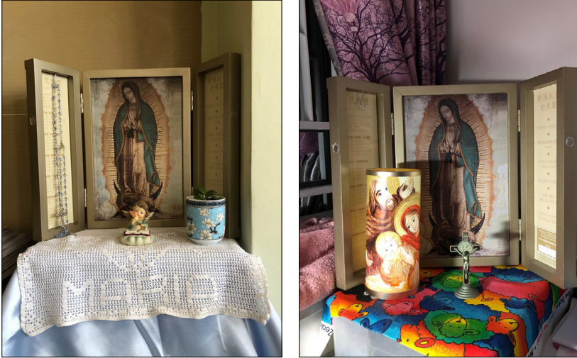
Figure 4: Altar space for Our Lady of Guadalupe from Rebecca in different household circulation period.