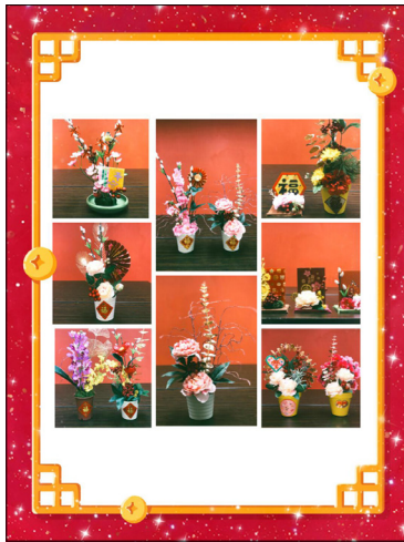
Figure 8: Gina's art crafts with her group.