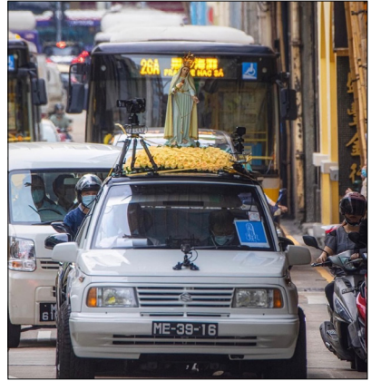
Figure 1: The procession of Our Lady of Fatima 2017 and 2021.