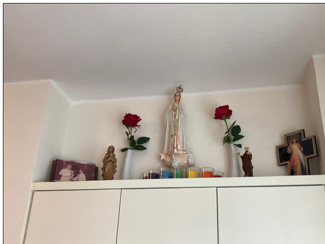
Figure 6: Devotional images at Hanna's house.