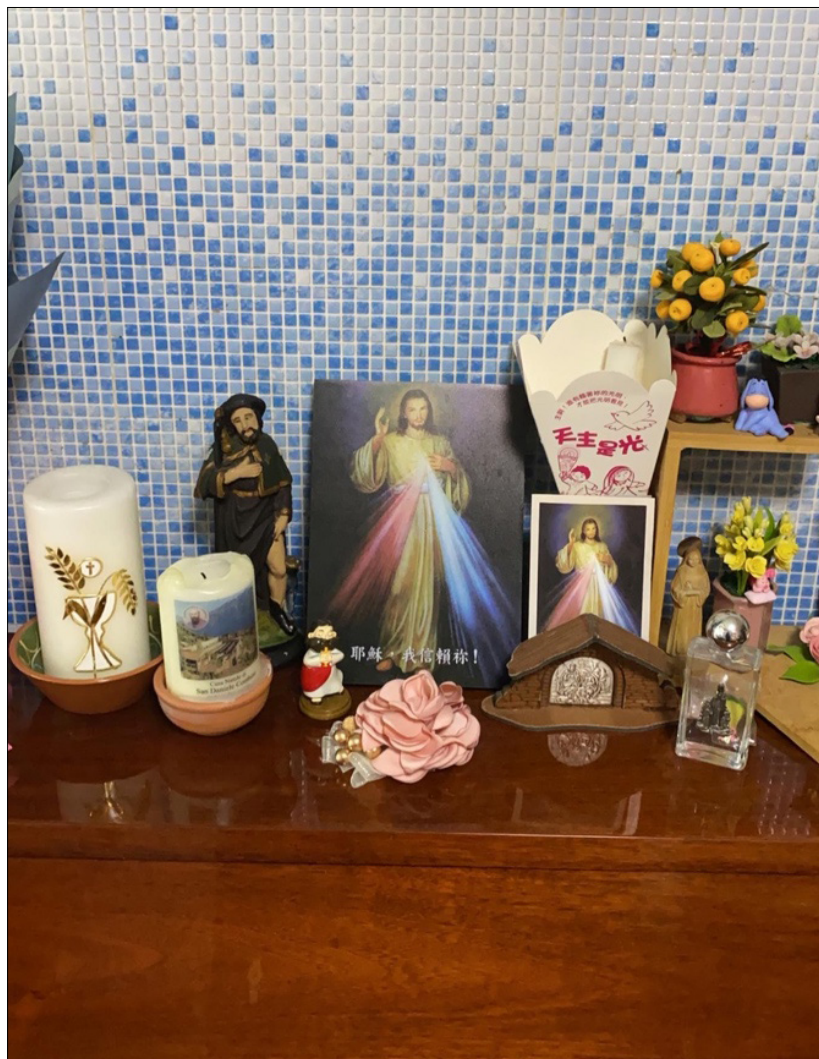
Figure 2: Home altar of Esther.