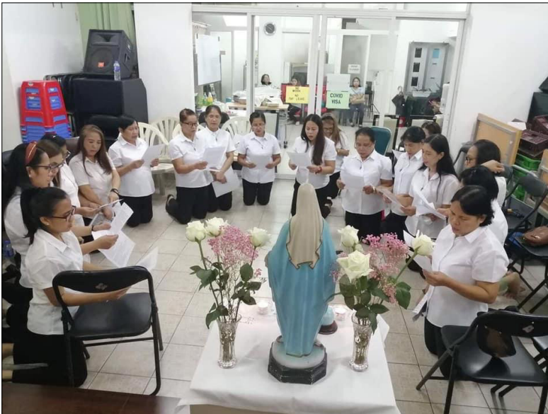
Figure 11: Devotion to Our Lady of Perpetual Help at Filipino Pastoral Center during the pandemic.