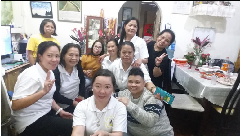
Figure 10: Household circulation of Our Lady of Perpetual Help.