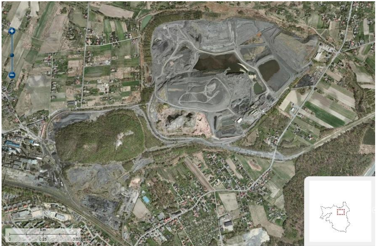
Fig. 2. Orthophotomap of a dumpin Czerwionka-Leszczyny

Due to specific shape of the slopes, the mining waste heap experiences significant erosion and denudation processes. The deposited mining waste mostly includes clayey shales, mainly comprised of kaolinite and illite, as well as carboniferous sandstone, claystones and hard coal.