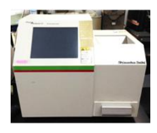
Figure 1. NIR spectrometer, model BR-5000

A=Ayahime, B=Aya, C=Daichirinko, D=Fukkurinko, E=Hoshimaru, F=Hoshiyome, G=Kitakurinn, H=Kirara 397, I=Nanatuboshi, J=Oborozuki, K=Sorayuki, L=Yukihikari, M=Yumepirika, N=Yukisayaka