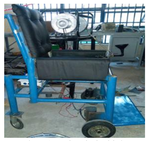
Figure 1 Developed Wheelchair

The weighted value shows the order in which each metrics is important to the design. The weighted values of each metrics were obtained through a process known as analytical hierarchical process (AHP).