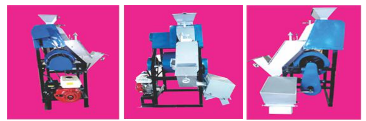
(a)Left end view (b) Front view (c) Right end view Figure 1: Melon Seeds Shelling and Separation Machine

The study was carried out at the crop processing shed and the laboratory of National Centre for Agricultural Mechanization, llorin using the newly developed melon seeds shelling and separation machine. Figures 1a, 1b and 1c show the various views of the machine. Other materials used include serewe melon seeds variety (figure 2a), laboratory oven (LAB-TECH<sup>™</sup>), tachometer (0.05+1digit, Lotron DT-2236B), digital weighing balance (0.1g, Camry EHA251), digital stop watch (0.01s, Kadio KD-6128), clean water, plastic bowls and polyethylene bags.