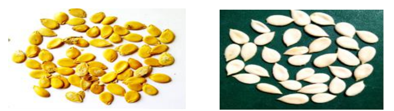
(a) Unshelled Serewe Melon Seed Variety (b) Shelled and Separated Melon Seeds Cotyledons Figure 2: Serewe Melon Seeds Variety