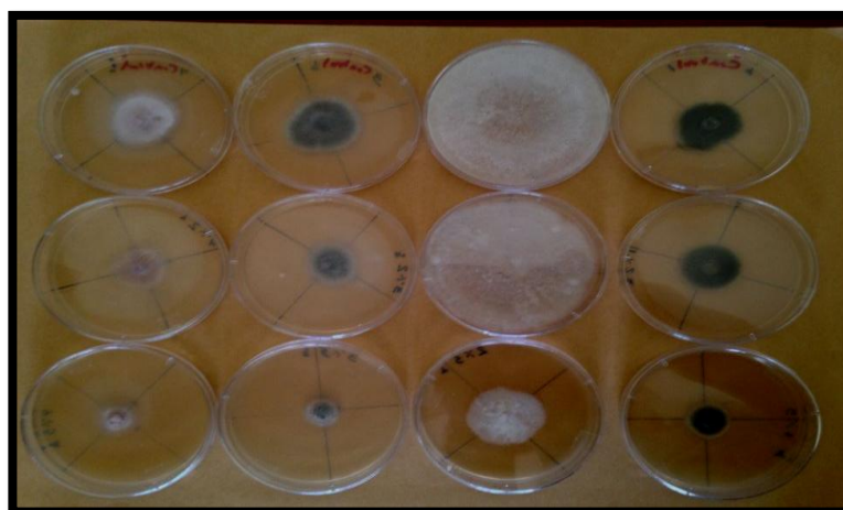
Figure (2): The activity of F.vulgare alcoholic extract on the mycelia growth of Alternaria alternata , Rhizoctonia solani , Phoma herbarum and Fusarium oxysporum (from right to left), at the concentration 0, 2.5, 5 % ( from up to down).

Aqueous and ethanol extract of F.vulgare were used showed significant inhibition of growth of Fusarium solani , Rhizoctonia solani and Macrophomina phaseolina (22). The aqueous and alcoholic seed extract of F. vulgare were evaluated for their antifungal activity against A. alternata , Mucor rouxii and Aspergillus flavus (Neet et al. 2013). Concentrations of 10, 20 and 30% extracts of F. vulgare reduced the fungal biomass production in all tested pathogenic fungal species especially in initial growth stage (23).