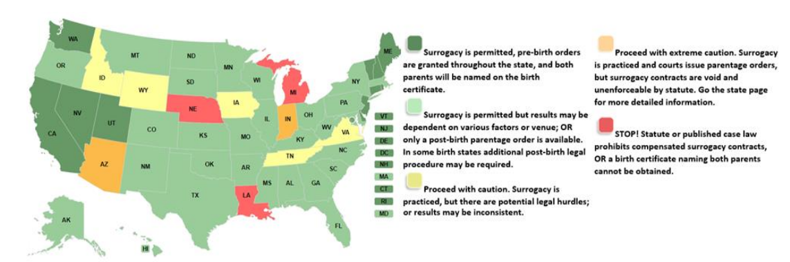
Figure 2: US Surrogacy Map.

Access to surrogacy also presents its own set of problems, although not exclusive to the LGBTQ community.