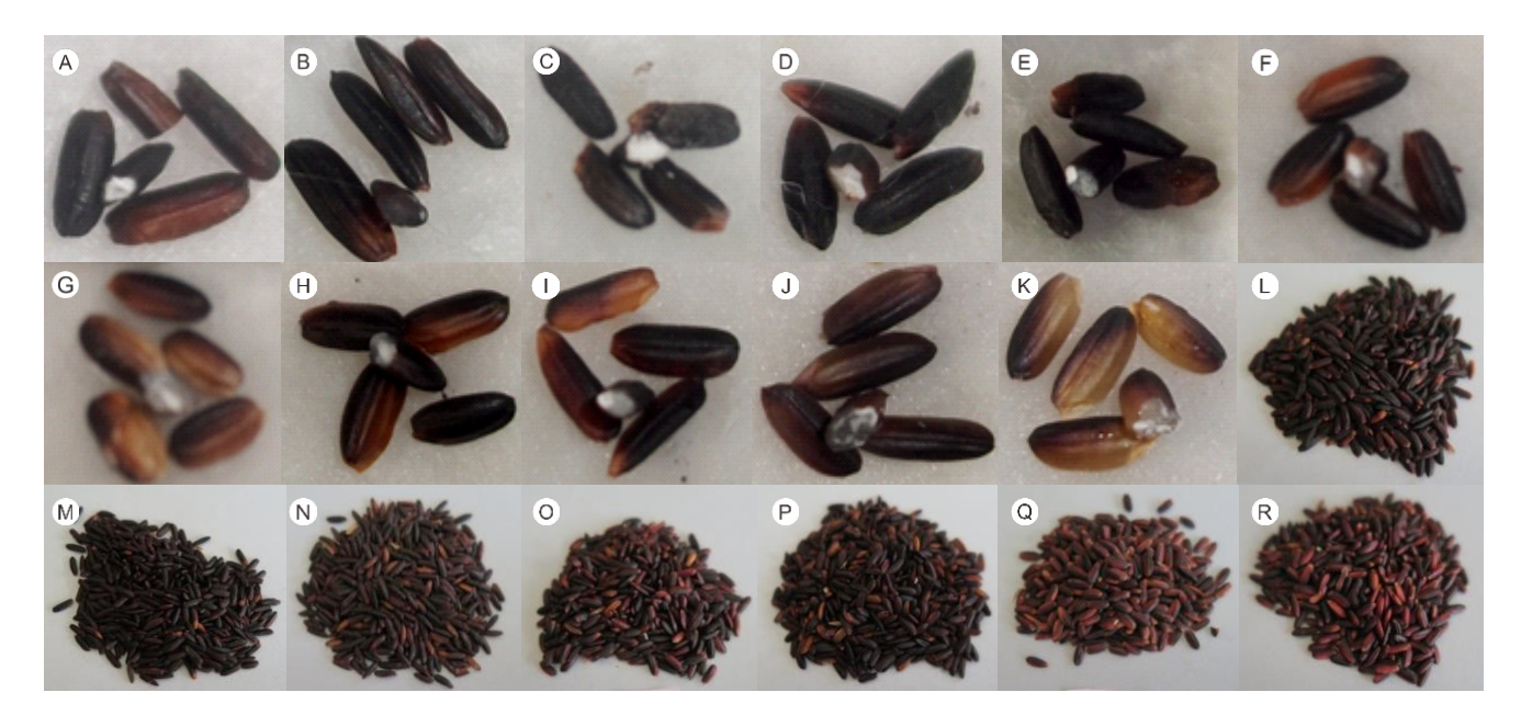
Figure 1. Appearance of rice color from 18 black rice cultivars. (A). Melik; (B). Jlitheng; (C). Cempo ireng; (D). Pari ireng; (E). Beras hitam NTT; (F). Beras hitam Bantul; (G). Beras hitam Magelang berbulu; (H). Beras hitam Magelang tak berbulu; (I). Beras hitam Sragen; (J). Beras hitam banjarnegara berbatasan wonosobo; (K). Beras hitam banjarnegara; (L). Beras hitam Tugiyo umur panjang; (M). Sembada hitam; (N). Beras hitam Muharjo; (O). Beras hitam Patalan; (P). Beras hitam Tugiyo umur pendek; (Q). Andel hitam 1; (R). Beras hitam Yunianto.

Black rice has a high anthocyanin content in the pericarp layer, which provides a dark purple color. The color difference of rice is regulated genetically. According to Chang & Bardenas (1965), the color of rice is determined by the pigments in the pericarp and the tegmen, namely white, bright red, red, reddish brown, brown, grayish, gold, purple, and purple (almost black), while endosperm from all rice varieties was