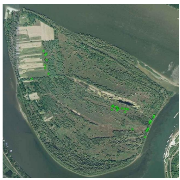
Fig. 1. Spatial distribution of subpopulations European White Elm ( Ulmus effusa Willd.) at Great War Island