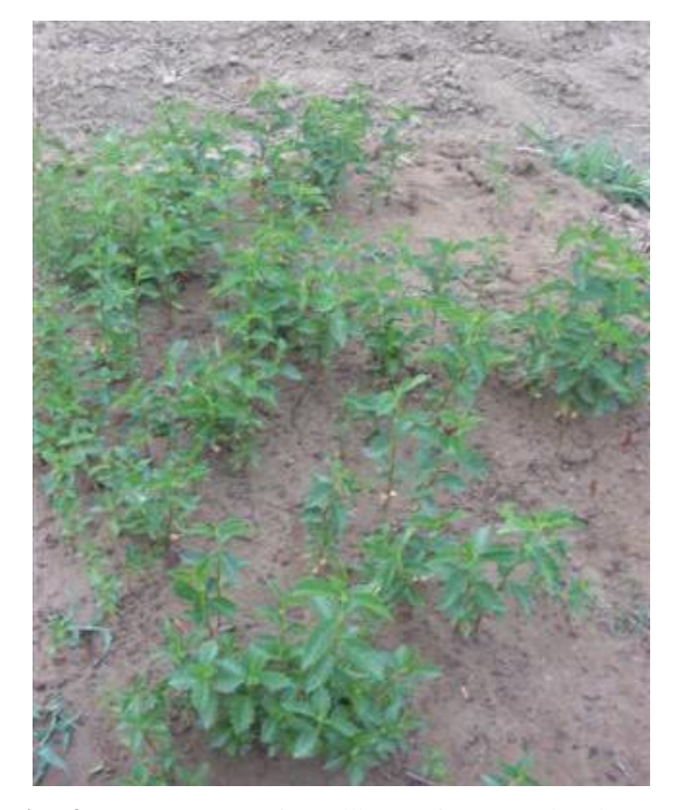
Fig. 4. Appearance of seedlings after germination

Basic statistical analysis of the data collected included the calculation of mean values, standard deviations (SD) and width variation. Clustering of the obtained mean values and the homogenity of groups were tested by Tukey HSD test. The origin of variability was examined by analysis of variance (one-way ANOVA). The interdependence of the morphological parameters was tested by calculating the Pearson correlation coefficient. Closeness (distance) of mother trees based on the above parameters was tested by cluster analysis.