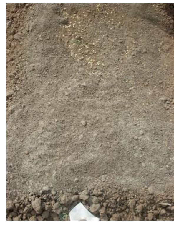
Fig. 2. Seed beds with seed partialy covered

daily until seedlings appeared, and then less frequently (every 3-4 days) (Figure 4). Each of the half-sib lines samples was taken from 50 one-year plants with bare-roots, their height (H) and root collar diameter (D) were measured. Roller's sturdiness coefficient, as the ratio of the height (cm) and diameter (mm), were calculated (R oller 1977, Ivetić 2013).