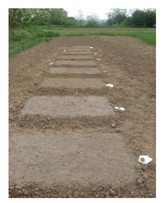
Fig. 3. View on the seed beds sown and covered

daily until seedlings appeared, and then less frequently (every 3-4 days) (Figure 4). Each of the half-sib lines samples was taken from 50 one-year plants with bare-roots, their height (H) and root collar diameter (D) were measured. Roller's sturdiness coefficient, as the ratio of the height (cm) and diameter (mm), were calculated (R oller 1977, Ivetić 2013).