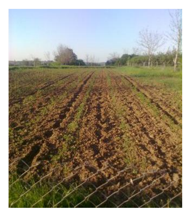
Fig. 5. The layout of rows of seedlings