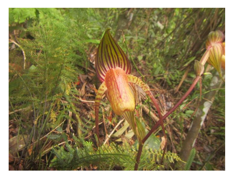
Fig. 3. Critically endangered Paphiopedilum adductum Asher