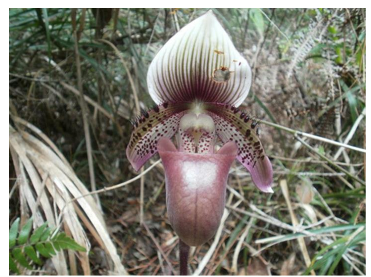
Fig. 4. Endangered Paphiopedilum ciliolare (Rchb.f) Stein