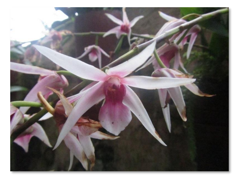
Fig. 5. Vulnerable Epigeneium treacherianum (Reichb.f ex Hook.f.) Summerh.