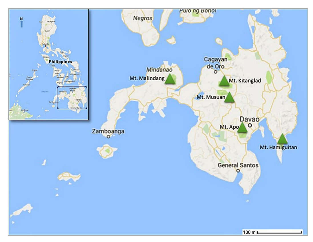
Fig. 1. Geographical location of Mindanao Long-Term Ecological Research Sites

Species richness of endemic species richness is typically used to estimate the biodiversity value of a region (Nagendra, 2002; Clergue et al., 2005; Orme et al., 2005). One of the most important tasks for conservationists is therefore to find objective methods for assessment of natural areas in terms of their conservation priority (Jankowski et al., 2009; Kindlmann & Vergara, 2009). Defining conservation priorities is essential in minimizing biodiversity loss (Brooks et al., 2006; Jacquemyn et al., 2007) as it ensures that conservation action focuses on the species at the greatest risk of extinction and on the sites that are most important for their protection. The Long-Term