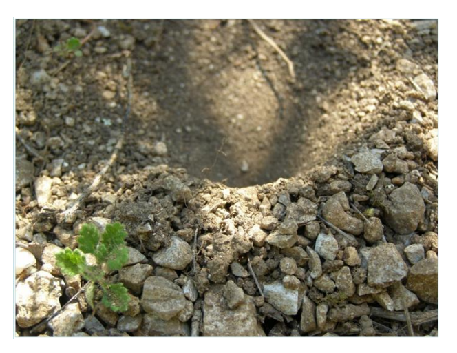
Fig. 2. Characteristic habitat (sand funnels) of the larvae of Libelloides lacteus

One month later and according to our expectations, during a careful field inspection we have noticed a number of characteristic sand funnels (Fig. 2), on bottoms of which we had found and sampled a few adult larvae.