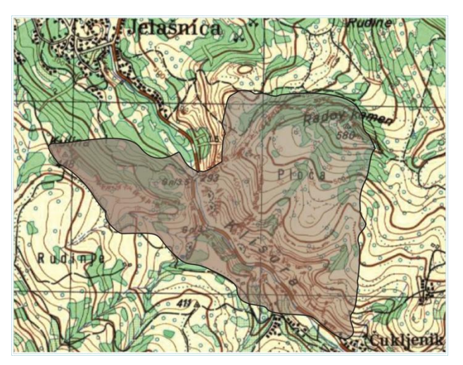
Fig. 5. Site Pleče in the Jelašnica Gorge

research would complement a comprehensive biologycal knowledge on this species.