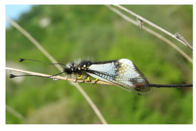
Fig. 1. Libelloides lacteus in Jelašnica gorge

In a few recent years of fieldwork in Jelašnica Gorge area, species L. macaronius had been found rather regularly. In early May of 2012, however, we had found a few adult specimens of A. lacteus species, clearly discerned by it's charachteristic habitus of white base colored wings with blue tones heading toward an apex area, as opposed to L. macaronius whose wings are dominated by a yelow. We have sampled evidential specimens and made our snapshots in situ (Fig.1).