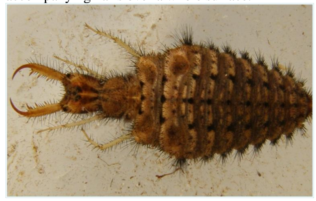
Fig. 3. Larva of Libelloides lacteus

Conserved larvae have been photographed previously (Fig. 3), followed by dissection of a mandible under a binocular and preserved in a form of a permanent microscopic slide preparation (Fig. 4). Comparison of larvae habitus and morphological details of mandible to the same parameters found on other related species, led to an unambiguous conclusion of the matter being a larval species listed (G e p p, 1984). Mandible is characterised by three pronounced teeth on the inside, with presence of an accompanying hairs over a whole surface.